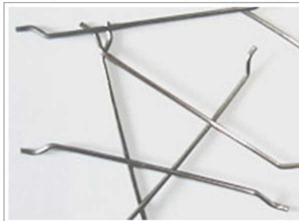
Figure 1: Steel fibers

necessary for fixing the specimen in the testing machine and for measuring strain. The remaining 150 mm bar length was covered inside the specimen. The modulus of elasticity of the high tensile strength steel bar was 206 GPa and its proof strength was 358 MPa. Table 1 lists the specifics of each test specimen.