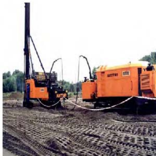
Figure 2: (a) Deep wet mixing plant; with (b) separate mixing and holding tanks and pumps