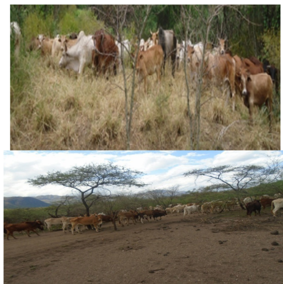
Fig.5 Encroachment of grazing land to forest areas