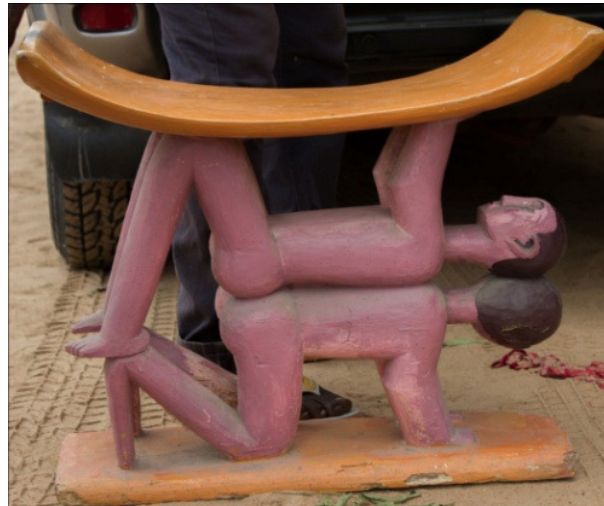
Figure 4: Stool of Osubonpanyin Chief

prayers (Rattray, 1954). Sarpong, (1974) added that, it is believed, especially by wood carvers, that the good wood for carving has a spirit which has to be pacified before the tree is felled. For this, the carver needs to observe some taboos and always have to cleanse the tools utilised. The colouring of mauve and beige appear to be wearing off indicative of the fact that the stool lacks conservation and restoration and due to that some parts are even broken. See figure 4 below.