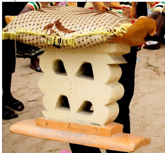
Figure 2: Stool of Ohenmaa