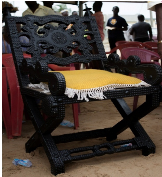
Figure 1: Chair for Tufohene.