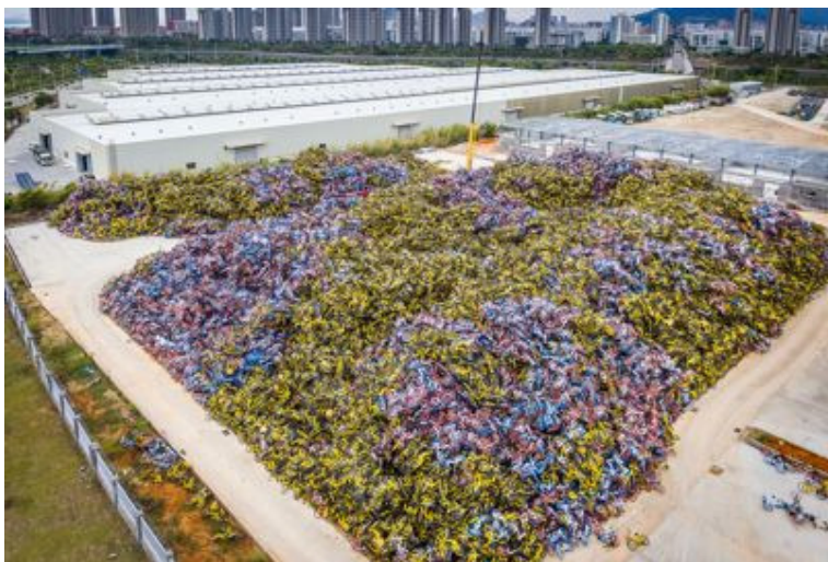
Figure 3: Image of Discarded/Impounded Shared Bikes

According to the source, there are in excess of a 120,000 bikes in this single image. This amounts to at least half a million (US$) in inventory at about $4.20 a bike which is probably a conservative estimate in wholesale cost. The bikes that ofo utilizes are built especially for the firm and according to its own specifications. This also includes the bespoke locking mechanisms that keep them from being stolen or utilized without paying. Of course, ordering these bikes in such high volume allows ofo and its competitors to benefit from cost reductions achieved through volume rates. Rare is the company that can profitably afford to replace its revenue producing resources every year or so which is why it does not behoove ofo to have so many of its bicycles end up being impounded by whatever municipality they are placed in.