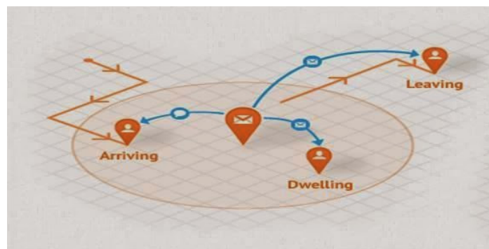
Figure 4: Logistics Geofencing Applications

Variances and subtle changes within the logistics and transportation industry can greatly affect, often negatively, a firm’s profitability and competitiveness. Hence, the logistics and transportation field benefits from automation and thus geofencing solutions can be used to accomplish the following types of efficiency outcomes: 29,30