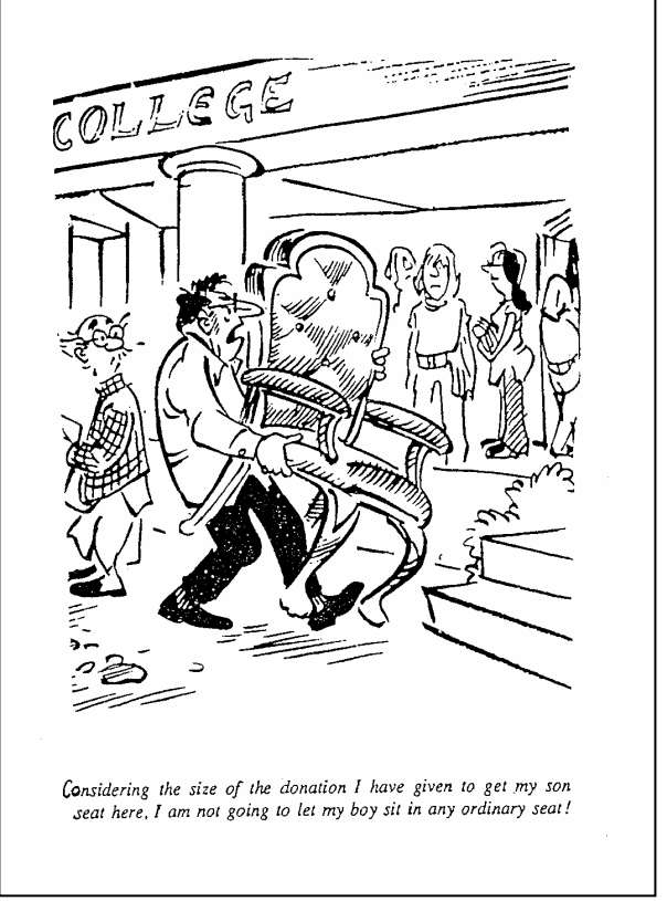
Fig. 1 Fig 2