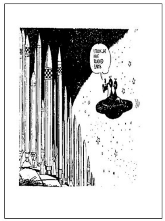
Fig. 7 Fig. 8

The unexpected contrast present in the above cartoons can be used to activate the readers' sensitivity, awareness, and concern towards the issues brought up through them. Both the cartoons are packed with abundant meaning. The issues of 'poverty and homelessness' and 'arms race' have been raised by contrasting animals and human beings in Fig.7, in terms of their respective living conditions, and aliens from the other planet and human beings on earth in Fig.8, in the context of arms race. As the presentations are highly suggestive in nature, they offer a lot of scope for the readers to put their ideas and arguments out. We can use such cartoons for group work and ask the students to discuss and record their observations and reflections and write a detailed analysis. We can give them the following tasks: Analyze the cartoons. Your discussions should answer the following questions—(a) What is the central idea in the two cartoons? (b) Is the idea presented in an effective manner? (c) How can the same idea be presented differently, i.e. by using other situation? Discuss.