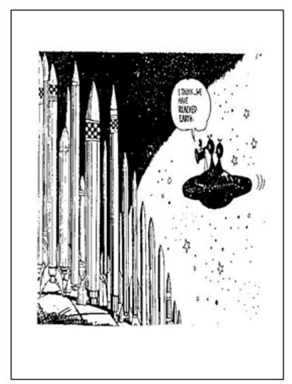
Fig. 9 Fig. 10

Here the students can be asked to write a catchy title like 'Money to burn ...', 'Common man's burden ...' etc. They may also be asked to write small captions for the pictures. It is also possible to give them topics such as 'Smoking-- how good and bad?, 'Common man's life' and ask them to write small essays using the two pictures.