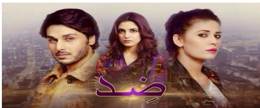
Figure 3: "Zid" drama serial title image (2015).