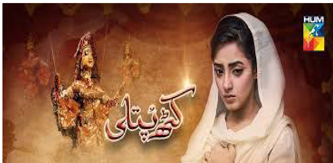
Figure 2: "Khathputhli" drama serial title image (2016).