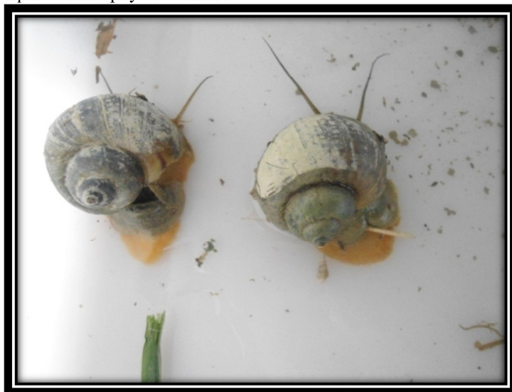
Picture 1. Its image represents the snail during the experiment in the laboratory

Thus, it is concluded that P. canaliculata has potential for use as a biocontrol organism of submerged aquatic macrophyte L. minor .