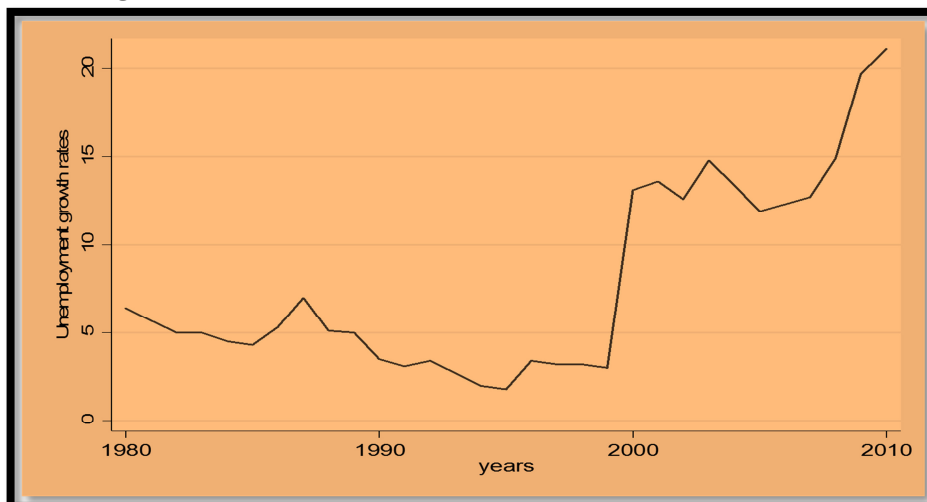
Figure 1: NIGERIA'S UNEMPLOYMENT RATES TREND (1980-2012)

Unemployment has been a major problem for most countries across the world. The USA for example has increased from 5 percent in 2007 to 9 percent so far in 2011. Spain increased from 8.6 percent to 21.5 percent; UK from 5.3 percent to 8.1 percent. Ireland currently stands at 14.3 percent from 4.8 percent, Latvia from 5.4 percent to 16.5 percent, Greece from 8.1 percent to 18.4 percent, and Italy from 6.7 percent to 8.3 percent. The average for the Euro area is 10.7 percent. Even within the African continent, unemployment has risen with South Africa, Africa's largest economy having a higher rate than Nigeria at 25 percent, Angola at 25 percent, Botswana at 17.5 percent, Egypt at 11.8 percent, Kenya at 11.7 percent, and Namibia at 51 percent.