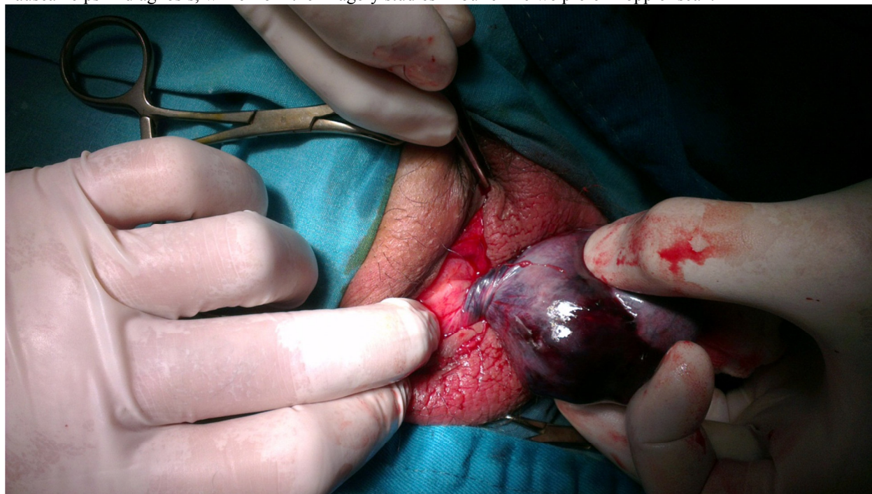
Figure 1. Testicular torsion with subsequent Testicular gangrene (Department of Pediatric Surgery-University Clinical Center of Kosova)

and it is presented with pain, edema, and redness due to superficial hyperthermia, while the testicular torsion (figure 1) has lower incidence but is potentially much more serious condition, with symptoms: sharp pain that can first occur in lower abdomen or groin, and later on can be localized in affected testis, all this can be accompanied by nausea or vomiting. In cases where acute ischemia is present, delay in diagnosis and intervention can lead to a testicular gangrene. Depending on the number of twists, necrosis may occur after as little as 2 hours [4]. Careful anamnesis, especially type of pain, localization, intensity and if it is accompanied by nausea helps in diagnosis, while from the imagery studies in our clinic we prefer Doppler scan.