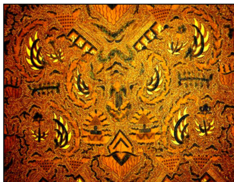
Picture 1. Semen Ramawijaya Batik, approached by the concept of Tribuana/Triloka and mandala, illustrates the relationship between universe or underworld ( alam sakala ) to move towards Oneness ( alam niskala ) through middle universe ( alam sakala niskala ), which bring about the balance, harmony, and unity while each of them gives power/energy centrally.

From Javanese cultural view semen ramawijaya is beautiful and displays tuntunan (guidance) in its classical motif (based on the concept of Triloka/Tribuana and Mandala). It is as if Semen Ramawijaya batik painted to be seen from above, tree of life is appeared to be surrounded by other motifs. The pattern composition of Semen Ramawijaya batik is motifs combination that consists of tree of life, garuda motifs in left-right sides, under the tree of life is a pair of structures motif under which is a pair land animals motif. With regard to the philosophical concept of Tribuana/Triloka, the tree of life motif as the illustration of intermediary world or middle world ( niskala-sakala universe) is a counter balance/link between underworld ( niskala universe)— through middle world ( sakala-niskala universe)—and upperworld ( niskala universe).