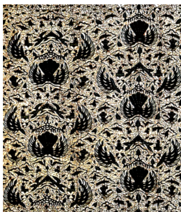
Picture 3. Classical pattern batik is imitation batik (Javanese: tiron, putran ). Remeng batik with black ground is called remengan (gurdan) batik (Surakarta style) while its white ground counterpart is called Sidomulyo (Yogyakarta style).

position, di the right-life of the top and the top there are three building motifs upon which is meru motif combined with bird motif. It seems that all of them guard the existence of the tree of life.