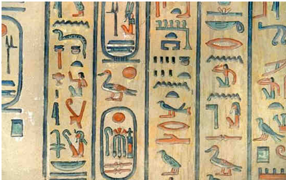
Figure 1. An Egyptian hieroglyph