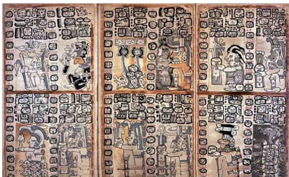
Figure 2. The Madrid Codex: Maya hieroglyph

There is, in fact, scarcely any human endeavour that does not subscribe to the munificence of visual elements in its daily operations. Visuals are a very vital feature in communication, be it primitive or modern, analogue or digital. Graphic design, therefore, takes full advantage of this important factor. Warner (2009) submits that graphic design is principally about visual communication, information and persuasion using print and electronic media. Today, technology has allowed for access to visual media such as digital media, video games and television in a way that young adults have integrated these media into their daily lives (Glore, 2010). Evidently, visual elements thus have a