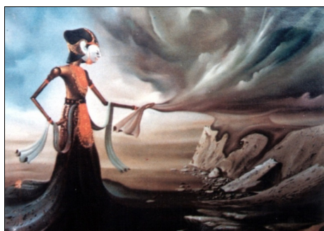
Figure 9: Ivan Hariyanto (1993), Mengibas Awan (Flicking the Cloud) oil paint on a canvas, size 90X70 cm.

The art of painting with symbolic abstraction is conceptually a form of modern painting arts making use of wayang figure as the basic element of its composition. The use of wayang has contextually experienced reduction as the artist interprets the form of wayang symbolically. The appearance of wayang figures is no longer as thematically idea realization but as textual symbol presented by the artist in order to provide free interpretation for the viewers.