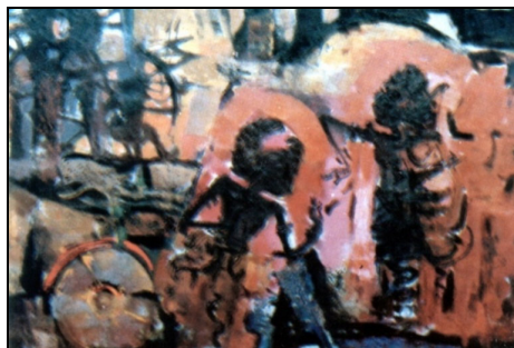
Figure 7. I Made Sudibia (1993), Dialog di Padang Kurusetra (A Dialogue in Kurusetra Field) , oil paint on a canvas, size 110 X 90cm.

On the Figure 6 we can see the story of Ramayana in the scene of The Meeting of Shinta and Hanoman . This scene tells that when Shinta was kidnapped by Rahwana , Rama asked Hanoman to bring Shinta back. The painting is designed in expressive manners with figurative composition reflected from such figures as Hanoman , Dewi Shinta and Trijata . The style of the painting is Balinese contemporary painting style. The painting is a form of painting art reinterpretation as the realization of the artist's engineering in delivering his ideas. The composition is arranged as a whole as if it reminds us to the form of pakeliran in wayang kulit purwa . The typical characteristic of artworks with concepts of reinterpretation is transformation of inspiration to aspiration (Kartika, 2012:110).