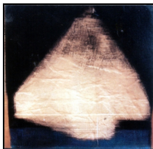
Figure 10: Nunung WS (1991), Gunungan , acrylic and collage on a canvas, size 100 X 100 cm.

The main characteristic of this group's works is the indirect expression of the artists in showing their feeling through their works. In expressing their mind, artists tend to show the relationship between forms and main meanings symbolically. Visually, the forms shown by some members of this group directly need interpretation. Meanwhile, some others show the forms that need to be thought first in order to give clear meanings. The works of this group emphasize more on the combination of aspects initiated by traditional idiom so that the works provide full opportunities to viewers.