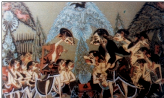
Figure 4: Sumadi (1993), Pertemuan Panji Asmarabangun dengan Para Pengawalnya ( The Meeting of Panji Asmarabangun with His Guards ): glass painting of wayang beber painted with revitalization concept.

The main basis of art of revitalization is traditional art. Thus, the strategy of its creation is conducted using concepts of conservation or conservation with mutrani ( nunggak semi ) (imitating the tradition based on the basic rules). However, the processing of the technique and the materials should be in accordance with the current needs.