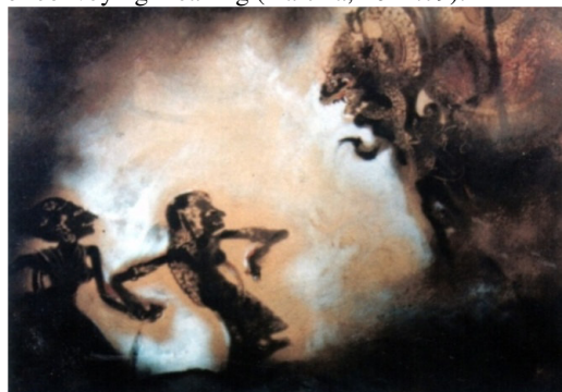
Figure 6: Wayan Suartha (1993), Hanoman Duta , oil paint on a canvas, size 95 X 75 cm.

The works of symbolic reinterpretation are developed with a concept revealing private concept seeing life through humans' behaviors. The behaviors are mostly reflected from the figures or the stories in wayang . It creates assumption that wayang has a very deep dimension reflecting attitudes and behaviors in life. Through paintings, the artists ask the viewers to reflect their life through their works. In other words, it is assumed that their works belong to subjective impression painted with one thematic scene in a story, instead of works reflecting scene as a means of conveying meaning (Kartika, 2012:79).