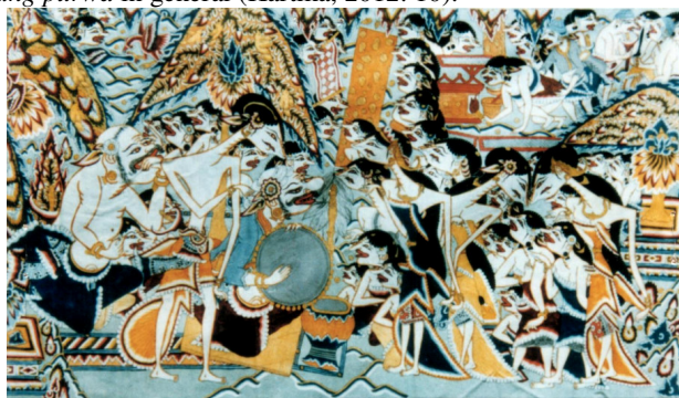
Figure 1. Wayang beber with Pacitan style with the scene of conversation at Karangtalun Market, made as instructed by Mangkurat II.

Kartika (2012) mentions that news written by Ma Huan ( \pm 1414 M) set straight the existence of wayang beber in Majapahit, but the form of painting and stylization were not explained, and therefore, it is likely that the style was different from wayang beber heritage from Pacitan and Gunung Kidul (Groeneveldt in Kartika, 2012: 10). However, seen from the physical aspect, it can be simultaneously concluded that the characterizations in wayang beber (see Figure1) must have been improved because Islam forbid the slight depiction of face, neck or whole body just like wayang purwa in general (Kartika, 2012: 10).