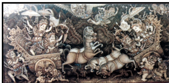
Painting Art of Modern Balinese Puppet with Pita Maha Style (Picture by Kartika, 1998)

Painting with Pita Maha style used wayang theme as a source of inspiration of artists to create the works. The shape of wayang is obvious, as well as the technique of painting wayang which has given plastic anatomic impression. Thematic shift happened from the theme taken from Sutasoma book and religious books to themes of everyday life. Color simplicity and composition consideration were influenced by modern aesthetic concept of R. Bonet and Walter Spies. However, those two painters kept applying traditional and characteristic coloring technique and painting style. Western aesthetic concept was still limited on anatomy and the change of theme. However, the modern wayang painting appeared to undergo some innovations to be recorded as a leap of Balinese modern painting history (Kartika, 2012:49)