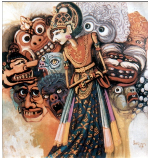
Figure 8. Oedijono (1993), Cobaan , acrylic on a canvass, size 100 X 100 cm, (Repro photo by Kartika, 1998).

Traditional idioms portrayed do not only represent particular idioms, but also serve as a form of life symbolism. Semar and Arjuna , for example, are not only main figures, but idioms reflecting the artist's ideas through the symbolism in life. The artist tries to express the idea through idioms as one of symbols conveyed to viewers.