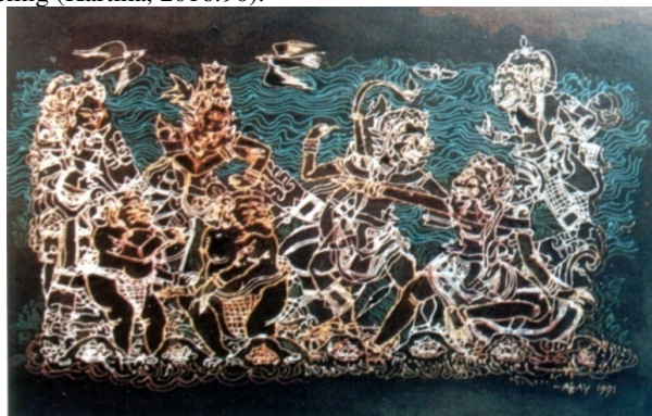
Figure 5: Abay D. Subarna (1993), Fragment 1 , oil paint on a canvas.

Traditional idioms as the results of reinterpretation present as a combination structure with modern technique of elaboration. Therefore, there will be variation in style depending on the reduction done by the artists. Although the works portray manipulation of certain story, the story idea is merely a result of stimulation in revealing the artist's feeling (Kartika, 2016:90).