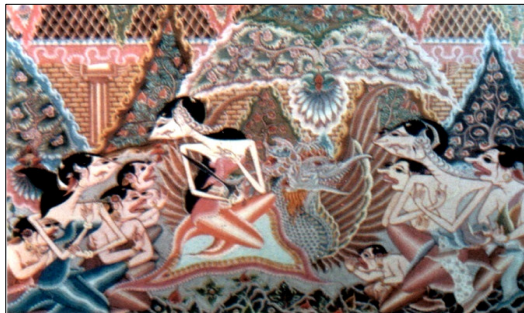
Figure 3: Karmin (1993), Dewi Sekartaji sayembara , a glass painting of wayang beber

The works created by the artists are study-tradition works attempted to find alternatives for conservation by representing or imitating cultural heritage. The works of sanggar are regarded forms of reproduction with innovation since the artists employ reproduction technique by imitating and adjusting the volumes with innovation or by imitating some models, while the volumes are selected from jagong (acts) which are then arranged based on story ideas.