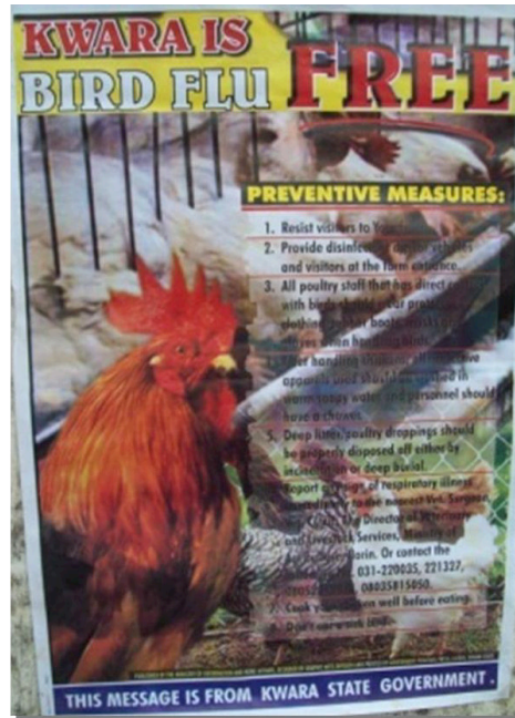
Plate I: A poster on Kwara is Bird Flu Free by Kwara State Government, Nigeria.

activities during the media production process that would have generated effective graphic communication. The graphic and typographic elements in the poster (Plate I) are laden with syntactic uncertainty, which created a higher noise-to-signal ratio. The prime messages and particularly the supporting information are lost as a result of excessive variation of lines and haphazard placement of design elements. In addition, it is clumsy, wordy and illegible; which is aggravated by a showing-through-background. Also, it neglected the principles of organisation, particularly, Economy and Dominance in the way the elements of design are combined. So, the stimulus conditions necessary for proper perception of the graphic messages are inadequate and could be said to lack credibility for use as an IEC material to facilitate effective communication for development.