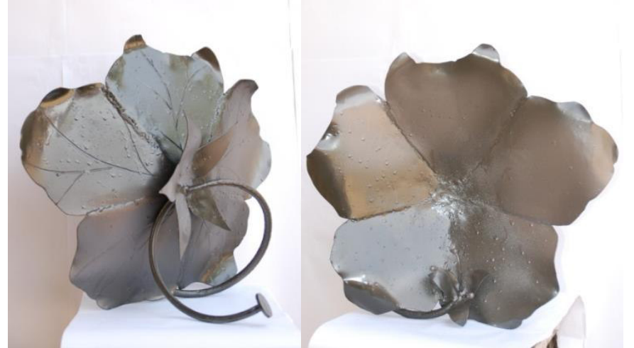
Plate16: Multifaceted, 50x53cm, Sheet metal, iron rods and bearings, 1012