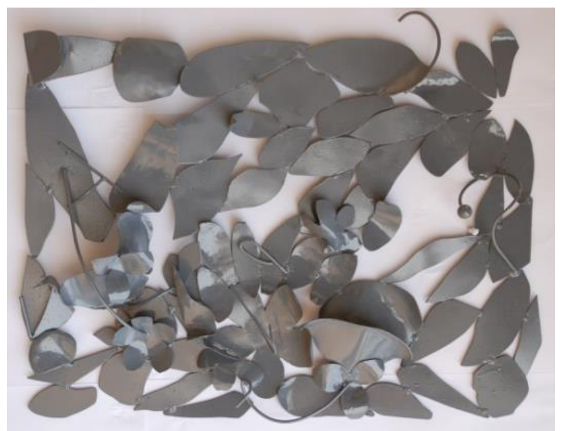
Leni (2013) Fall I, 58.4X76.2 cm, Sheet metal and iron rods, 2012.