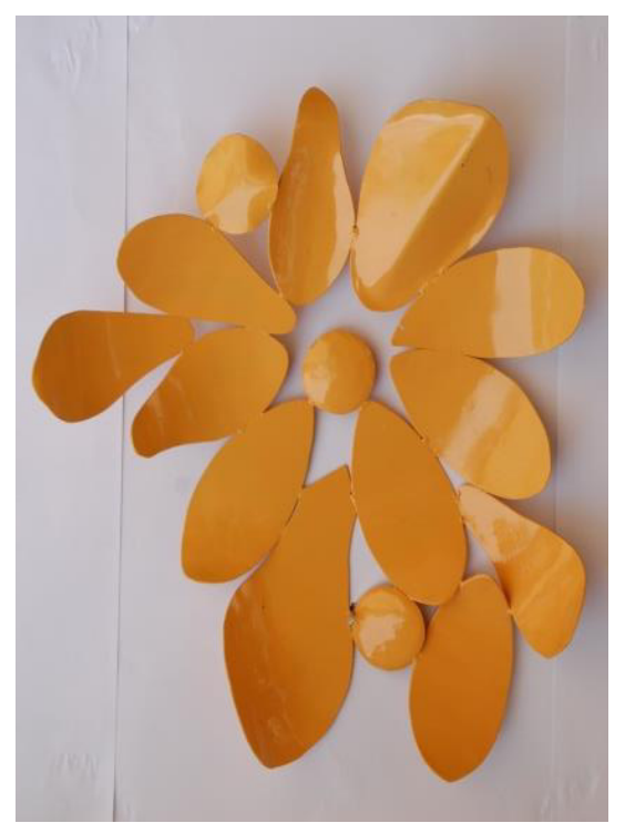
Plate11: Concerted, 55x45 cm Inches, Sheet metal, 2012.