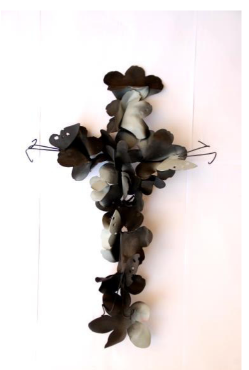
Plate8: Pollination, 76x50 cm, Sheet metal, 2012.