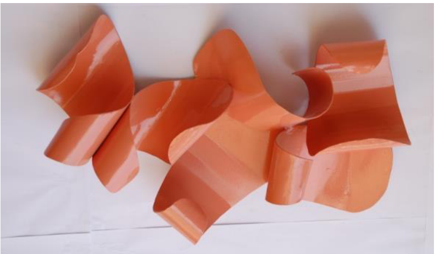
Leni (2013) Fall II, 66cm, Sheet metal, 2012