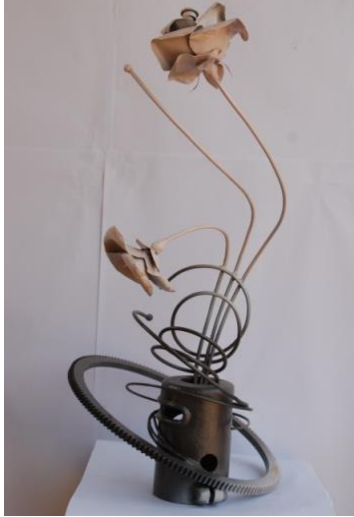
Plate 5: Spiral Rose, 71cm, Mild steel, 2012