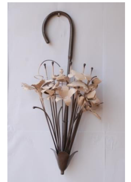
Leni (2013) Umbrella, 68.5 cm, Sheet metal, 2012