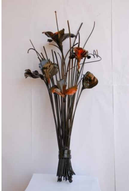
Leni (2013) Broom, 81 cm, Sheet metal, 2012.