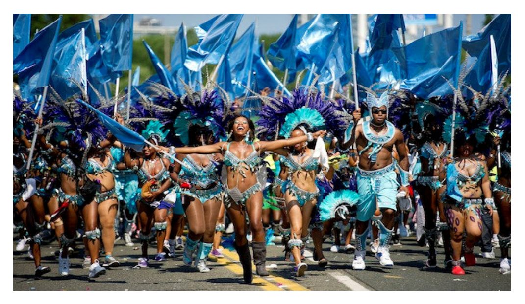
(Fig. 2-2 Carnival Street Parade)

The festival is held in August, one of the hottest months in the Caribbean. The feeling of emancipation brings together peoples of all statuses, celebrating to the intoxicating sound of music, dance and food into a pageantry