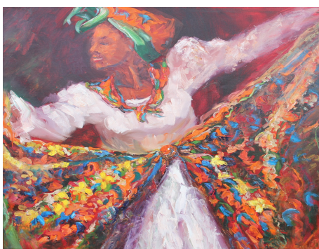
(Fig. 2-4 National Dance Festival)