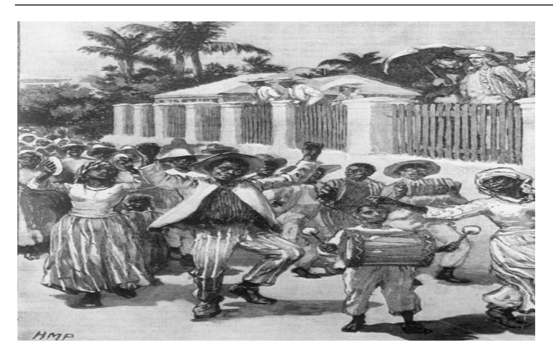
(Fig. 1-2 Traditional Carnival Celebration)