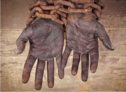
(Fig.1-1 Slavery Period)

As a result, Emancipation Day is commemorated every year in territories where slaves once resided. In Grenada, a public holiday is set-aside on the first Monday of August. This joyous day is celebrated with much importance to the citizens of Grenada because it is on this day that total independence was granted. Emancipation Day is celebrated very colorfully and in a grand manner. People throng the streets in huge numbers as spectators and performers depicting the devils and the social commentaries of previous years. They are accompanied by dance and sounds of steel bands and DJ's music of the latest songs of the year. (Fig. 1-2)