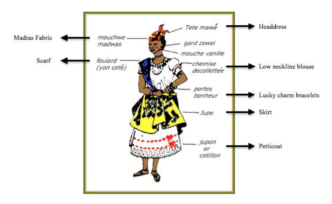
(Fig.1-3 Grenada's traditional Dress)