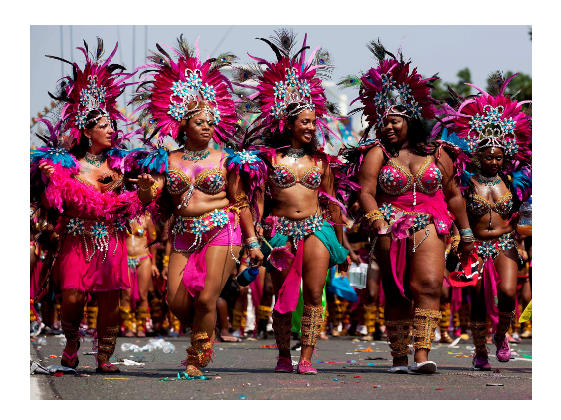
(Fig. 2-1 Masqueraders)