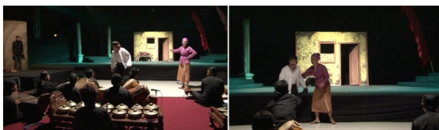
Figure 4. The intimacy between the actors and musicians in Longser .

The fourth art form is modern theatre (drama) manifested through the character of the grinder man and the student. These characters speak realistically about life and problems with logic which is suitable with their viewpoints and social class. The student as the intellectual read his life problems with sharp analysis on the existence of the world. Modern theatre can integrate the four forms of the performance in the scene when Badega, Lengser, and Kabayan meet in a place questioning about the stone grinder. They share their viewpoints and feel of one destiny to seek for the stone grinder.