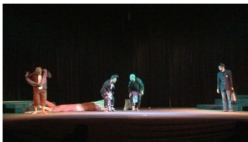
Figure 5. Position and standpoint of Kabayan, Lengser, Badega, and the student

The concept of siger tengah is implemented in the blocking of the performance chosen. Each group takes their scene based on the interpretation of the director. The director refers to the harmony by showing social class, especially in the scene of sandiwara and kingdom. The example of scene showing social class as well as balance space distribution: