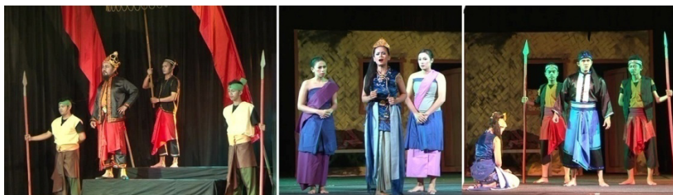
Figure 2. The domination of king cannot be denied, and it made the prince and princess suffered.

In the feudal community, the rich became the center of people's life. They were the source of fortune for some families organizing their wealth. In this time, many families work for the rich to take care their field, their farm, their plantation, and their breeding with profit sharing system. The traders got richer with more lands employing many families depending on them.