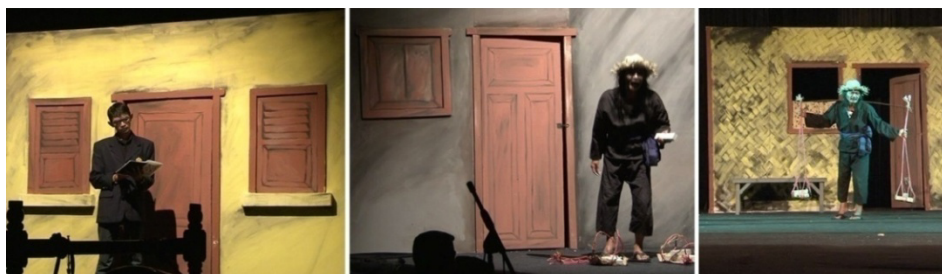
Figure 2. The student and the stone grinder questioning about the world and life.

he considered that the student had a higher social class. He called the student “Den” (shortened word of Raden , a calling for higher class). Meanwhile, the student also used fine language to the knife grinder because of respecting his older age. The language used was loma , standard Sundanese.