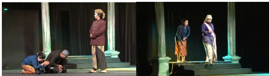
Figure 3. Attitude of honoring the master.

Kabayan responded to Badega's dialogue as follows: Aduh-aduh keder kuring mah ngadéngé kecap antay-antayan kitu mani kawas nyieun tambang (Gosh... I am confused listening to words in chains like this, like make a rope, TA:14).