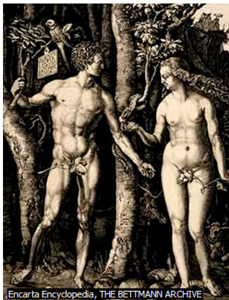
Fig. 1, Albrecht Dürer, Adam and Eve (1504), Engraving

Rembrandt's etching titled "Abraham entertaining the angels" (1656), captures the event described in Gen. 18:1-10 lucidly. Sarah is shown watching the three men from inside the tent while Abraham waits on them. He however does not know that they are angels. Of Isaiah's encounter, (Isaiah 6: 2-4) we are left in no doubt as to the fact that the "flaming creatures" are angels and that they bear wings; in this instance six each. Angels are included in this animal categorization for the simple fact that they bear wings, apparently with a semblance to those of eagles. No derogation is intended.