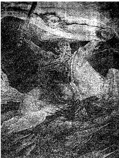
Fig. 2, William Blake, Death on a Pale Horse , circa 1800, Pen and Watercolour over Pencil, 39.5 x 31.1cm, (Source: Lister 1986)

The first reference to animals in the Bible is found in Genesis 1:24 where the creation of animals on the sixth day precedes the creation of man later the same day. It is logical then that a serpent be responsible for the temptation of Eve. Durer captures the moment succinctly for us in an etching depicting Adam and Eve in the Garden of Eden covering their nakedness with leaves while Lucifer is coiled up in the branches of the tree (Genesis 3:1-20) (see Fig. 3 below).