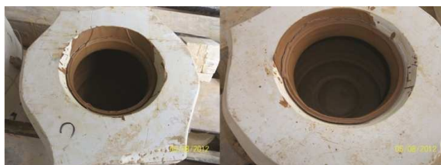
Figure 5b: Normal atmospheric pressure casting in Zutah Ceramic