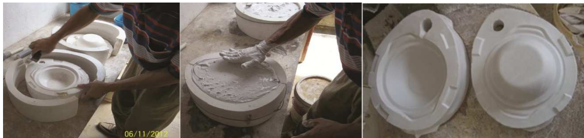
Figure 4: Pictures of how Master Mould is created from Case Mould

The technique used by Kelantan potter at this stage as three steps. Firstly, the plaster model created from the turning wheel is used to produce a master mould. Thereafter, the mould is used to create case mould and lastly, the case mould is then used to generate multiple master moulds which are then use for slip casting (mass production). Figure 4 shows how a case mould is used for creating master mould.