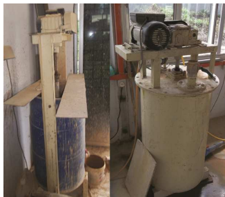
Figure 5a: Images of Plungers used in KESDEC for mixing compositions