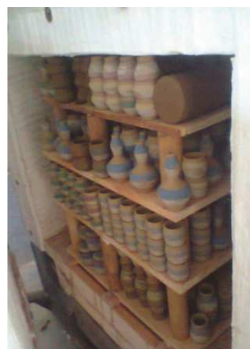
Figure 11: Loaded gas kiln at Zutah ceramics