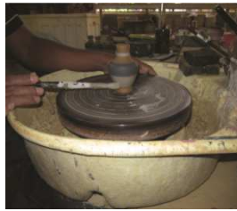
Figure 8: Decorating with coloured oxide