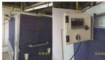
Figure 10: KESDEC's kiln under firing operation

Firing makes physical and chemical reaction takes place on the ware and gives it a fixed shape. The common kiln used by Kelantan potters is gas kiln. Glazed wares are fired to 1200°C while bisque wares are fired to 1000°C. Figure 10 shows a gas kiln at KESDEC ceramics under firing operation while figure 11 is a gas kiln at Zutah ceramics loaded for firing.