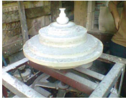
Figure 3a: Turning Wheel