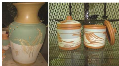
Figure 9: Pictures of wares with engraved/carved patterns