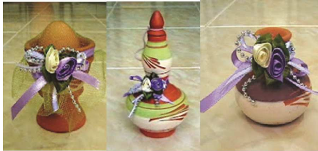
Figure 12: Packaged finished products

After firing, the wares are sorted to separate wares with defects from the successful ones. Therefore, wares without defects are package for selling or dispatch (see fig. 12).