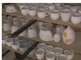
Figure 7: Green wares ready for direct gloss firing