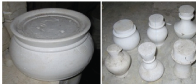
Figure 3b: Plaster Models produced on the turning wheel