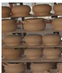
Figure 6: Drying of casted piece at KESDEC Ceramics

Fettling is the process of correcting parts that has any defect after casting process. This is done after removing the pieces from the plaster mould, after this, the wares are allowed to dry under atmospheric condition (see fig. 6) to reduce the moisture contents down to around 0.8%.