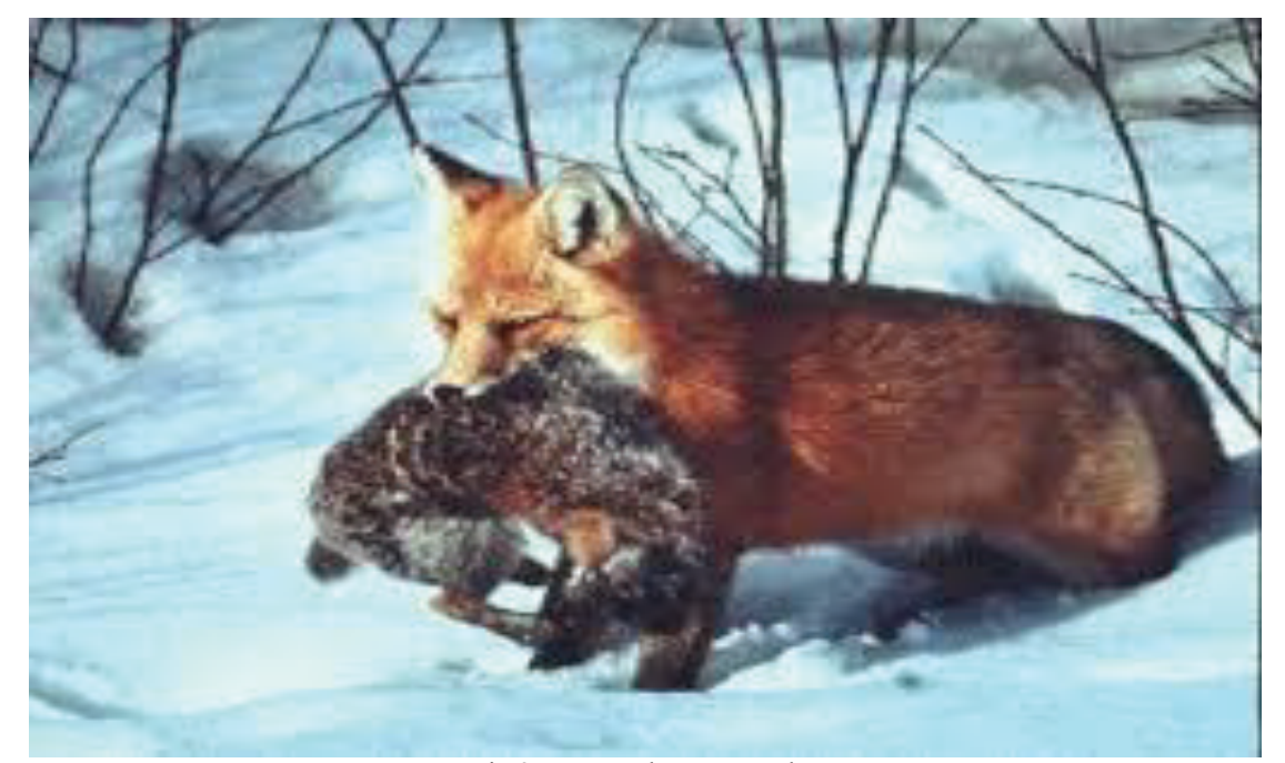
Fig.2 prey-predator examples