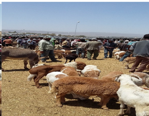
Figure: 3 Sheep market at Kurftu