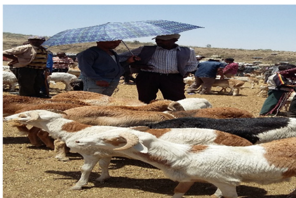
Figure 2: Sheep market at Adama

In the study area, livestock are generally traded by 'eye-ball' estimation. In some towns selling sheep by using live weight is also started. Live weight based shoat transaction is practiced in Adama markets. In eye ball based transaction, price is usually fixed by individual bargaining. Prices depend mainly on supply and demand, which is heavily influenced by the season of the year and the occurrence of religious and cultural festivals. During the time this study was conducted, the average price of sheep sold by eye ball estimation ranges from 1200-1600 birr for rams aged one and half year while the price of a kg live weight of sheep was 100 birr in Gefersa market.