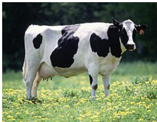
Figure 1: A Cow ready to be milked

The breast is a gland consisting primarily of connective and fatty tissues that support and protect the milk producing areas of the body. The milk is produced in small clusters of cells called areola which milk travels down to the nipples. Each nipple has 15 to 20 openings for milk to flow. Infant suckling or external pressure stimulates the nerve endings in the nipple and areola, which signal the pituitary gland in the brain to release two hormones, prolactin and oxytocin. Prolactin causes areola to take nutrients (proteins, sugars) from the blood supply and turn them into breast milk. Oxytocin causes the cells around the areola to contract and eject milk down the ducts. This passing of the milk down the ducts is called the “let-down” (milk ejection) IDF Doc. No.9002