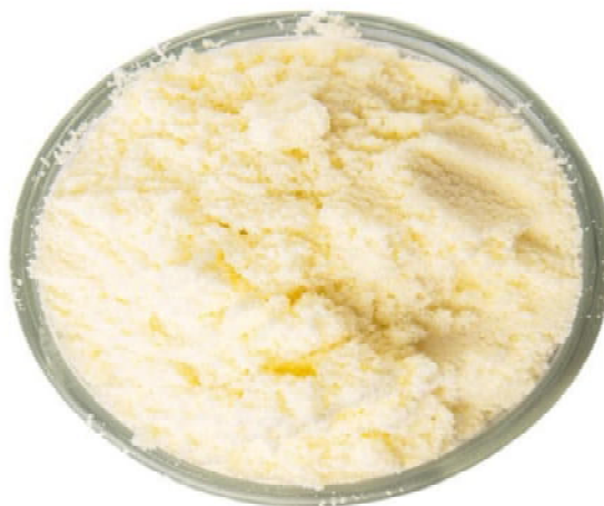
Fig 3 Dried milk in a bowl

According to K.N. Pearce and F , Glenn. (2018.) milk and milk products are often dried to less than 4 percent moisture to prevent bacterial growth and spoilage , to reduce weight and to extend shelf life .Two types of dryers are used in the production of dried milk products—drum dryers and spray dryers. The simplest and least expensive is the drum, or roller, dryer. It consists of two large steel cylinders that turn toward each other and are heated from the inside by steam. The concentrated product is applied to the hot drum in a thin sheet that dries during less than one revolution and is scraped from the drum by a steel blade. The flake like powder dissolves poorly in water but is often preferred in certain bakery products. Drum dryers are also used to manufacture animal feed where texture, flavour, and solubility are not a major consideration.