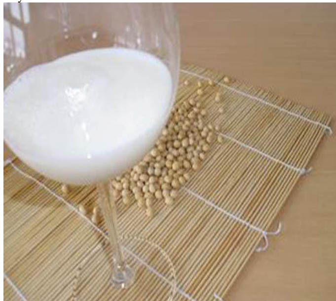
Figure 2: Soybean seeds and milk

The milk of animals that grow rapidly, such as cows, which double their birth weight in 50 days, is rich in protein and minerals; composed of 80 percent water, 5 percent fat, characteristic taste and texture, vitamins A, D, E, and K, as well as certain fatty acids. It contains many minerals, the most abundant of which are calcium and phosphorus and an excellent source of vitamins A and B 2 . Vitamin A, is found in the globules of fat and is removed when fat is skimmed away to make low-fat or skim milk.