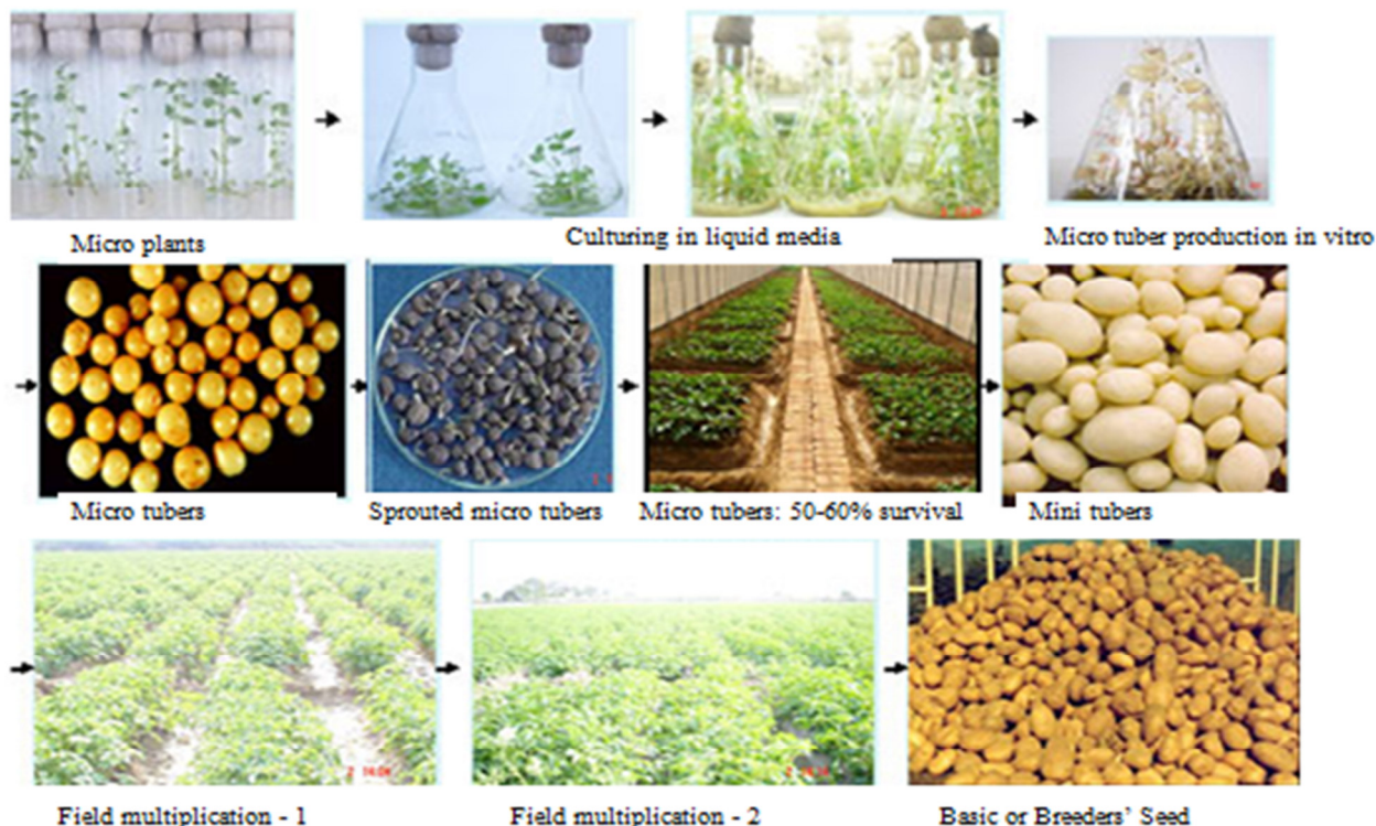
Figure 1. Potato seed production through micro tubers

Soil less production techniques, such as Nutrient Film Technique (NFT) and aeroponics have been successfully employed in tuber production with good prospects for certified seed production (Boersig and Wagner, 1988), cited by (Srivastava AK et al., 2012). Aeroponic system has comparatively higher multiplication rate as compared to conventional micro-propagation system. Harvesting in aeroponics is convenient and allows a greater size control by sequential harvesting. It has added advantage such as solution recirculation, a limited use of water and is safe from soil borne diseases.