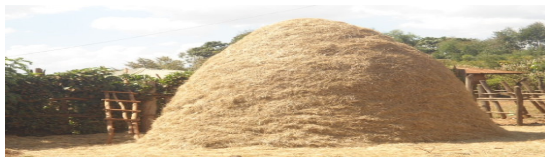
Figure 2. Heap of teff straw

In case of maize, 82.7% of the respondents from the highland and 26.7% from the mid altitude areas harvest the ears and leave the stover for on field grazing. Less maize stover is collected and stored for animal feeding because of its bulky nature and difficulty for transportation and because of its use as fuel wood. Other crop residues like wheat and barley straw and pulse haulms are less conserved and commonly left on the threshing area for in situ grazing. Similar report was published by Owen and Aboud (1988) who reported the bulky nature of crop residues and lack of means of transportation to be among the factors that constrain the collection and greater use of straws and stovers as feed. This also conforms to the report of McIntire et al (1989) who reported in situ grazing of crop residues throughout sub-Saharan Africa.