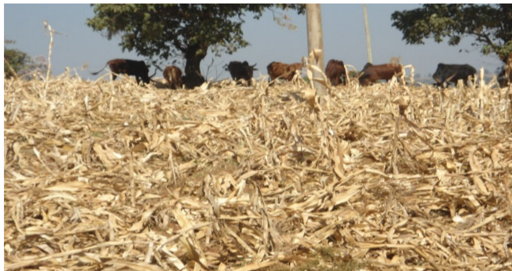
Fig.3 In situ (on field) grazing system of maize stover