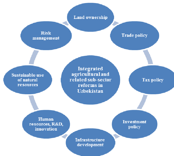
Illustration 1. Agricultural reforms in Uzbekistan

Agrarian reform has led to significant positive changes in agricultural production: production growth, increasing crop yields and livestock productivity. Gradual reduction in cotton fields has been directed for cereals, vegetables, potatoes, forage crops which enabled to prevent shortages and rising prices of food in early transition and global financial crisis periods. During 2000-2014 years grain production doubled and potatoes potato growing tripled through expansion irrigated land for cereals.