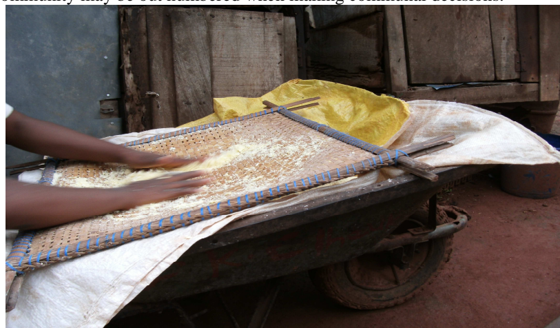
Fig. VI: Traditional cassava/garri processing in Nru Community, Enugu State.