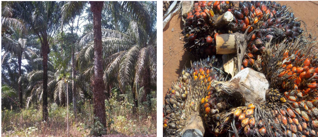
Fig. IV: Palm oil processing is amongst indigenous practices in the study area.

The principle of felt need- This principle is of the opinion that people living in a given indigenous community should be able to identify their vital needs in their environments so as to achieve a desired socio-economic development. Owing to the fact that they live in the environment, they should be able to come together to identify various obstacles to their socio-economic development. Such identifications are always effective when done by the members of the community.