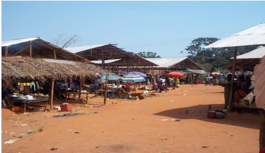
Fig.I: Orié Ohodo, A typical traditional market in the study area.

areas have already been misconceived as the economic backbone of a nation. Consequently, there exist investments and reinvestments in these urban areas and other useful developmental projects from both the public and private sector of the economy. This has greatly worsened the living conditions in those indigenous communities through redundancy owing to their failure to promote individual and collective initiatives to maximize their environmental potentials for their sustainable living.