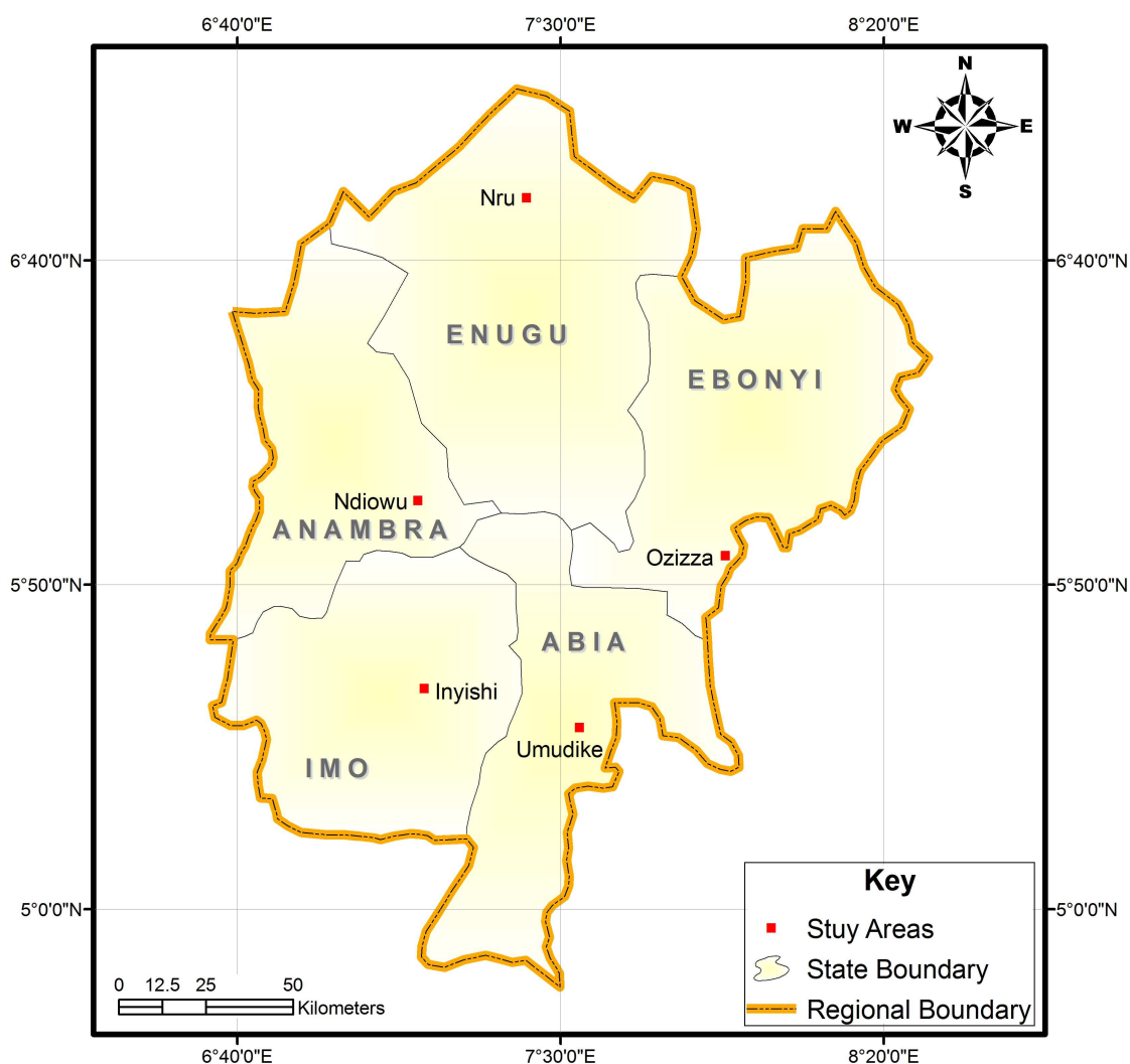
Fig. II: Map of the South-eastern Nigeria showing the study areas

Southeastern Nigeria is one of the geo-political entities that made up the six geopolitical zones in Nigeria. The zone is made up of five states i.e. Anambra, Abia, Imo, Ebonyi and Enugu states. Climatically, the zone is situated at the tropical rain forest with thick vegetation. The zone is notable for two major climates, wet (March-October) and dry (November-February) seasons, with other minor climatic conditions subsumed under the two major ones. Demographically, the zone has a total population size of sixteen million, three hundred and eighty-one thousand, seven hundred and twenty nine (16,381,729) which is approximately twelve percent(12%) of the entire population of the Federal Republic of Nigeria, judging from the 2006 National Population Census in Nigeria. The zone is the heart of the Igbo culture area of Nigeria where Igbo language and culture dominates other minor but similar cultural attributes in the region. The choice of the study area is owing to its availability of many indigenous communities coupled with its proximity in distance and knowledge to the researchers.