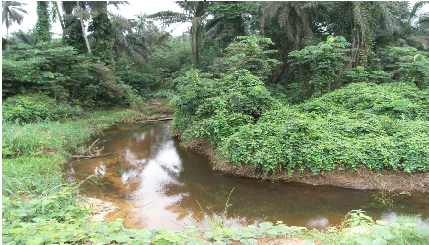
Fig. III : Vegetation and agricultural potentialities of the South-Eastern Nigeria

Close observation on the major economic activities of the indigenous communities as mentioned earlier and overall living standard of the people, revealed that most of these indigenous communities have not completely harnessed the great potentials of their environment owing to their ignorance to the role of principles of community development in meaningful socio-economic development of indigenous communities. Some of the amenities that had experienced these principles could not maximize the potentials of these principles to community development due to lack of cohesion, rural urban migration and poor overall appreciation of the implications of socio-economic development to the future of these indigenous communities. Tenets of these principles of community development include: