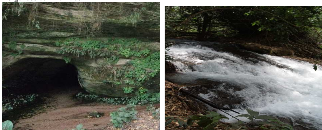
Fig. VI: Caves and Waterfalls as amongst the unharnessed tourism potentials of the region

The principle of self direction- this principle is of the view that people living in a given community should be motivated internally to initiate and implement developmental projects that would enhance economic viabilities of their community. “It states that mobilization towards participation should be internalized. People themselves are the vanguard of the developmental processes and they have the capacity to effect positive attitude towards the community. Self direction is dynamic in nature. It is progressive and static. It fosters the community towards greater level of development” (Abiona,2009:30-31). The above analysis of the principle of self direction by Abiona has expatiated more on the role of the principle to the socio-economic development and sustainability of indigenous communities.