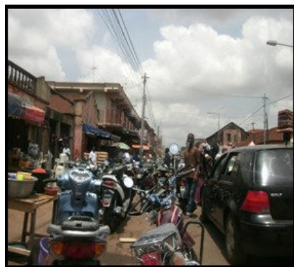
Figure 4. The Alabar area, two and half months after decongestion exercise