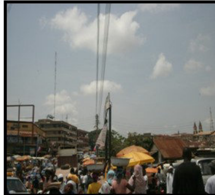
Figure 5. The Aboabo area, two and half months after decongestion exercise