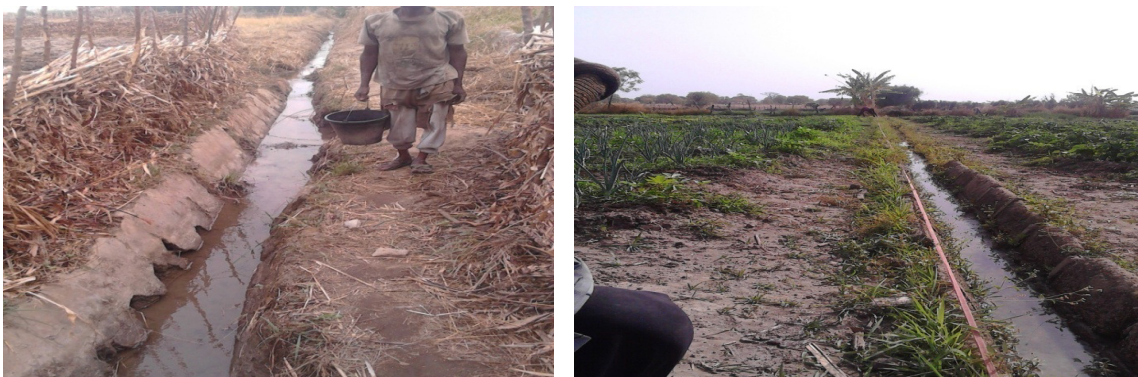
Figure 4.4 State of Main Canal and Lateral at Karni