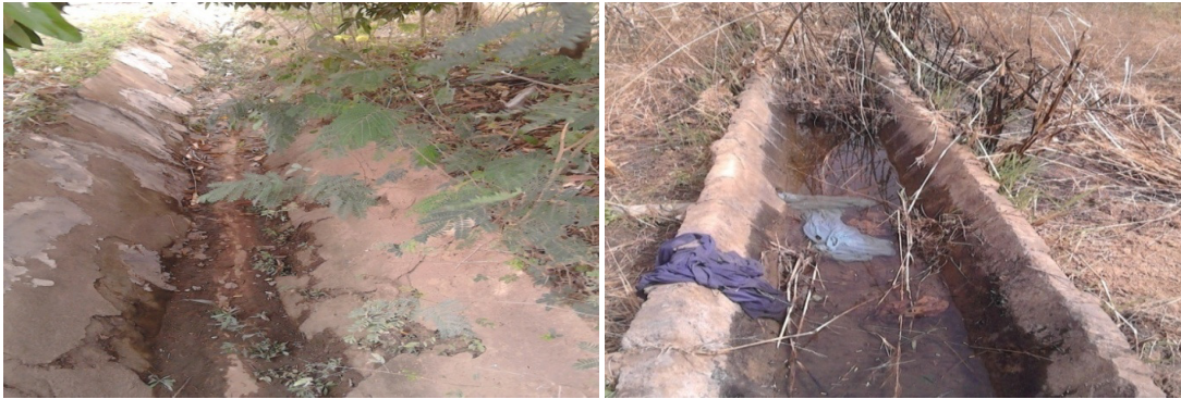
Figure 4.3 State of Right and Left Bank canals at Sankana

The right and left bank canals are 1.03km and 1.17km respectively. The bottom width of the right bank canal is 0.3m and the top width is 1.9m. The depth of the canal is 0.9m. The left bank canal measures 0.2m, 0.5m and 0.3m accordingly. A section of the left bank canal consists of 2Nr. 300 mm diameter Asbestos pipe aqueducts in parallel across an 18m spillway channel. There are 26 laterals constructed under UWADEP of which 9 are on the right bank canal and 17 on the left bank canal (GIDA-UWR, 2014). The total length of the laterals is estimated to be about 3.9km. They are lined with slabs and trapezoidal in shape. The average length of the laterals is about 150m, with spacing of 75-100m. The right bank laterals irrigate 40% (24ha) of the developed area and left bank 60% (36ha). The drainage system consists of the main Bulipielaa and tertiary drains. The main drain is 1.1km long. The tertiary drains are from plot to plot and discharge into the main drain from the last plot. There are no secondary drains on the scheme. The dilapidated state of canals in this scheme makes it difficult if not impossible to deliver the right amount of water to the fields. Siltation and non control gates results in a lot of water seepage from both canals.