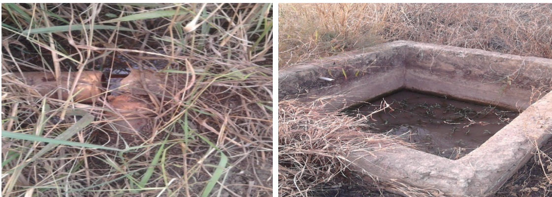
Figure 4.5 State of Pipes and Chambers at Kokoligu