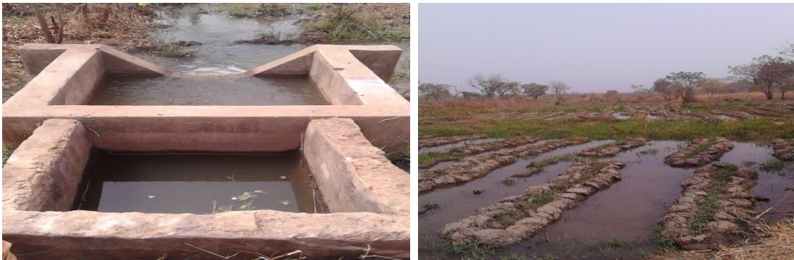
Figure 4.2 State of Notch and Bunds at Siru

Farmers construct bunds and gullies of various sizes for efficient water use and control. Bunds cross-sectional height ranges between 0.5m and 0.4 m. The lack of technical expertise or advice in constructing bunds normally leads to failure of most of these bunds due to the continuous flooding of fields and sometimes due to rain. Therefore, there is an urgent need to provide a facelift at Siru by constructing conveyance system, which will reduce wastage of water and also increase yield with good water management structures and provision of farmers' technical extension services.