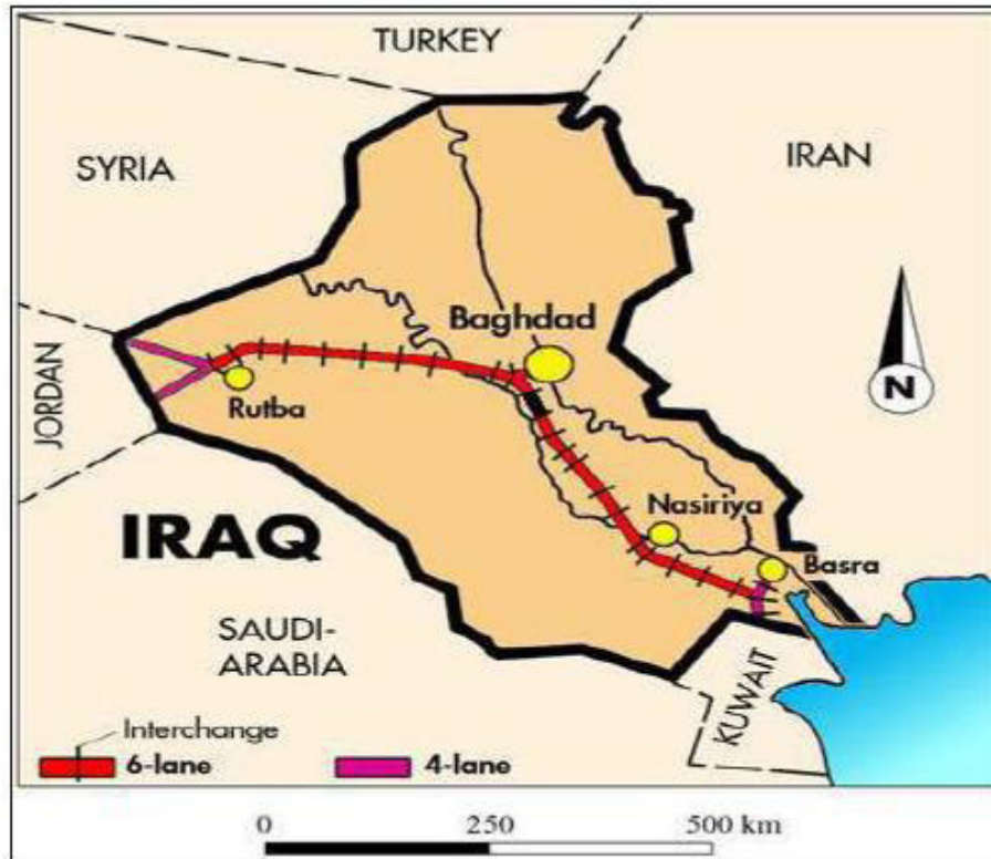
Plate (1) Location of Section R4/Expressway No.1 in Iraq