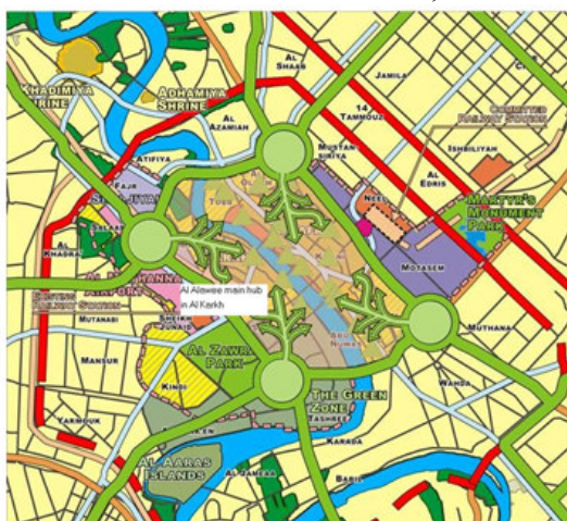
Figure (3) BCCDP 2030 Proposed public transit modes.

Al-Alawee hub has been selected to further explore the possibility of transforming major transit hubs into a future TOD zone within the city of Baghdad and specifically to investigate the existing potential to meet location criteria for a successful TOD hub. The hub’s current function, its multiple transit modes, and its mixed land uses are elements in favor of this selection, as shown in Figure (3).