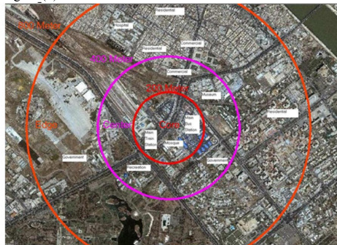
Figure (4) Zone of Influence of Alawee TOD main hub in Al Karkh and reflection of TOD principles

BCCDP 2030 envisioned the Al-Alawee hub as a major urban and regional transportation node serving Baghdad and major urban centers in the central and southern governorates of Iraq. Within the hub’s core zone (0 m – 200 m), the largest train station (labeled the “International Station”) is situated to provide rail lines to the north and south of Iraq. In the past, this station ran rail service to Istanbul, Turkey. The Al-Alawee core is also the current location for two regional intercity micro- and mini-bus stations serving southern urban centers. The National Museum, government administrative offices, a medical hospital, and a portion of the largest public park in Iraq (Al-Zawra’a) can all be found within the hub’s central zone (200 m – 400 m). The edge zone (400 m – 800 m) contains a multifamily housing complex, a large portion of Al-Zawra’a Public Park, a portion of a large vacant land parcel (which was once part of the old airport), and an old neighborhood consisting mostly of