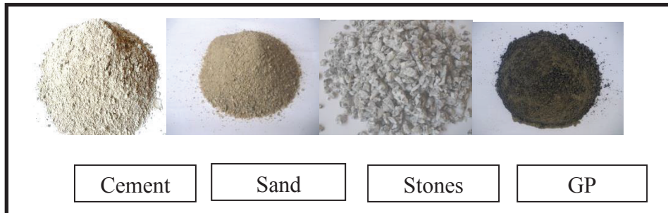
Figure 1: Samples of the materials used to develop the PCPBs

Ordinary Portland cement (OPC), fine aggregate (sand), coarse aggregate (stones), ground plastic (GP) and water were the materials used to develop the plastic concrete pavement blocks (PCPBs). Samples of the cement, sand, stones, and ground plastic used are shown in Figure 1.