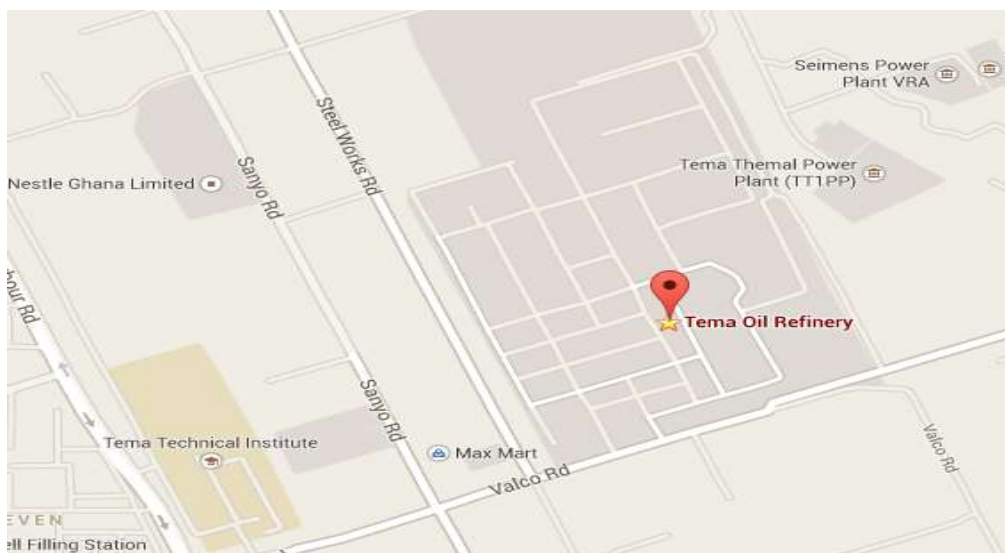
Figure 1: Location of the Tema Oil Refinery

Tema Oil Refinery (TOR) is located in the heavily industrialized area of Tema in Ghana and is situated 24km east of the capital, Accra. TOR It is linked to an Oil Jetty at the Tema Harbour by pipelines of various diameters for transportation of raw materials (crude oil) and finished products. The land of the refinery is 440000 square meters. The land area provides opportunity for on-site disposal of solid wastes. TOR is Ghana's only refinery established in 1963 to enhance the country's economic, investment and development programs. Crude Oil is used as a raw material by the refinery for production. The crude oil is usually imported from neighboring Nigeria and transported through pipelines to the refinery storage and tanks for processing into several finished products. The wastewater from the refinery is treated by the Wastewater Treatment Unit before it is being discharged into the environment. The wastewater comprises of storm water basin, stripped sour water and domestic wastewater. All these are channeled through the refinery wastewater treatment unit before it is discharged into the environment to a nearby lagoon called the Chemu Lagoon.