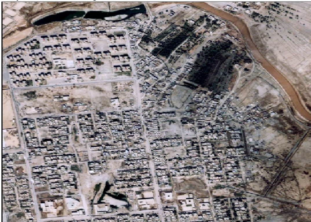
Figure 1 the original image used air

Can be seen by the numbers that have been obtained from research that 30% of Urbanism space in debtor represents random housing, a serious indicator threatens urban growth mechanism in the city of Samawah because the slums areas are illegal because they lack a healthy environment requirements and lead to visual pollution due to negligence considerations aesthetic of Urbanism, which leads to social disorder, so we recommend that those responsible for urban planning in the city and other official circles interested need to stop this expansion of others thoughtful, continuous and develop the necessary to preserve the city's environment and improve the image of urban planning based on future urban planning and stop this plan solutions management urban sprawl non-programmer at the expense of cutting the palm trees and the elimination of green environment. The results also indicate that the use of remote sensing technology is of great economic importance in the study of urbanization non-programmer and determine prevalence areas and relying on satellite images as seen from the mechanism used in the search urbanization of cities periods consecutive time and determine the positive and negative aspects for decision-making can be monitored Occasion .