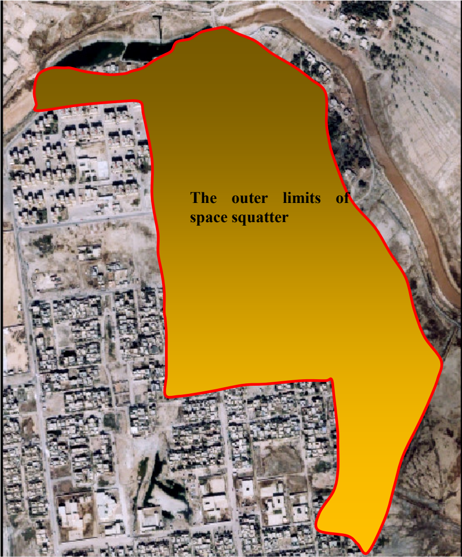
Figure 3 Air image specified by the area under the random housing