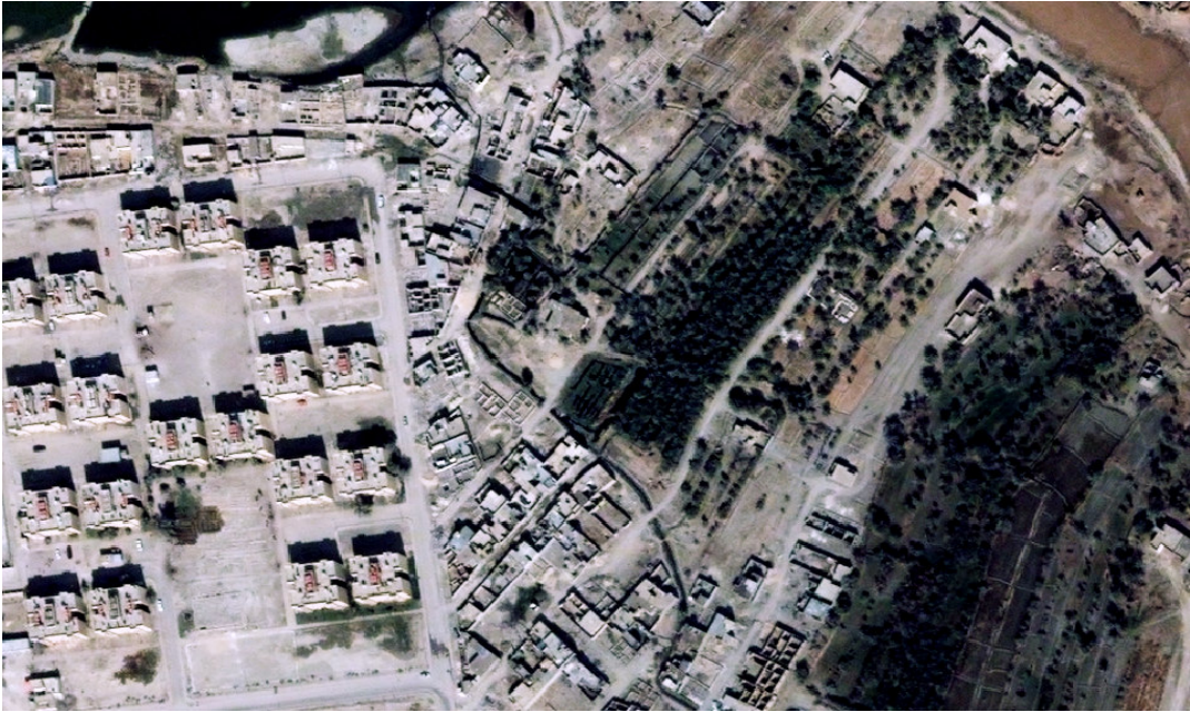
Figure 2 photo enlarged several times showing the density of random buildings