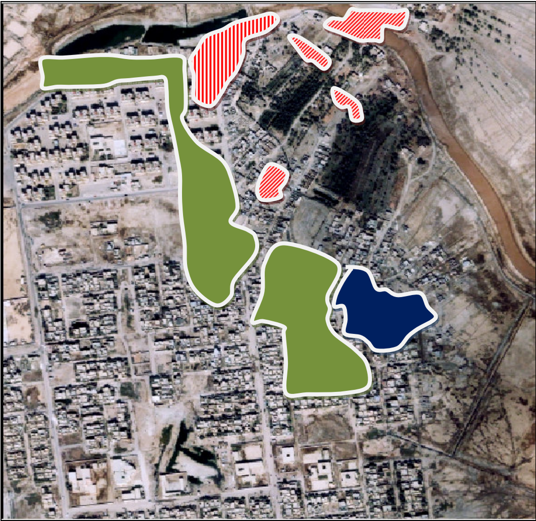
Figure 4 land area by population density