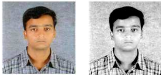
Fig. 2: (a) Original Image (b) Reconstructed image