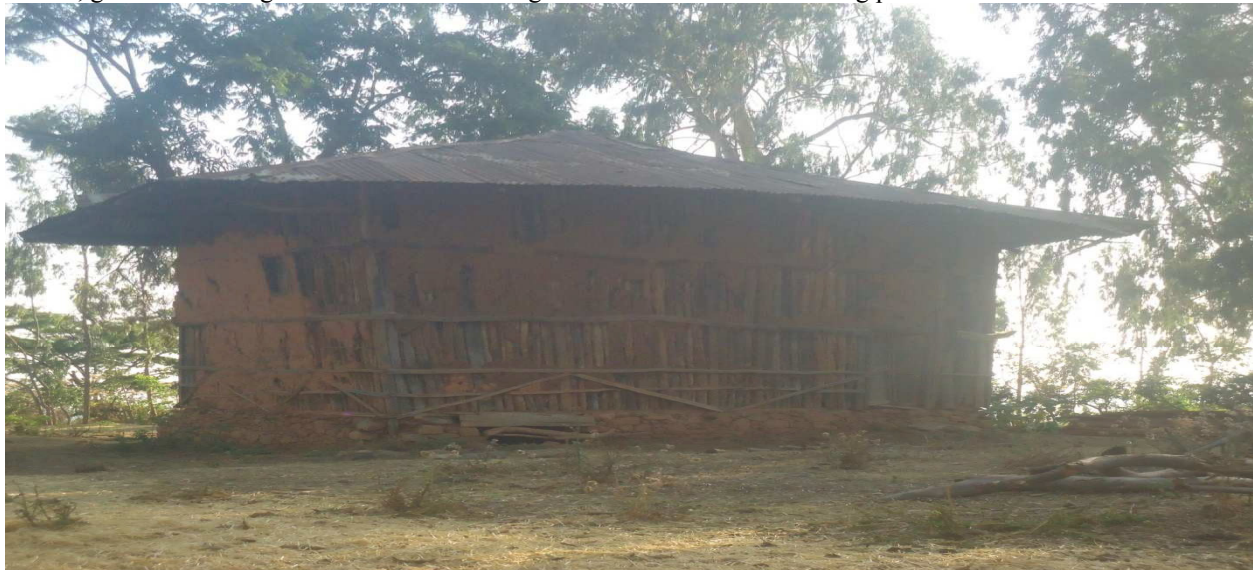
Figure 1. Fitawrari Duguma Jaldesso's Palace, constructed in 1930 E.C/1938.

constructed: his palace, fortification, church and his future grave around his administration site. His palace is registered as the third important palace in Wollega zone next to Dajjach Kumsa's palace of Leka Nekemte and Ras Mokonnen Damiso's of Arjo awräjä during this study conducted. Nowadays Duguma's palace, fortification, church, grave are still significant historical heritage of Limmu. See the following picture.