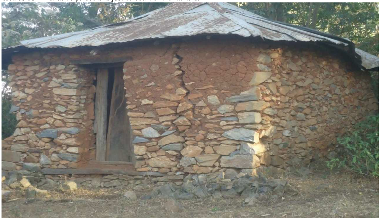
Figure 2. Fitawrari Duguma's tomb. February, 9, 2013.

Fitawrari Duguma Jaldeso Palace, constructed in 1930 E.C/1938 G.C, served as Italian administration center during that time. This house has two parts (underground part and above ground part). The underground part of the house had served to jail those individuals committed crimes. Whereas, the upper part of the house was used as administrative palace and justice court of the Italians.