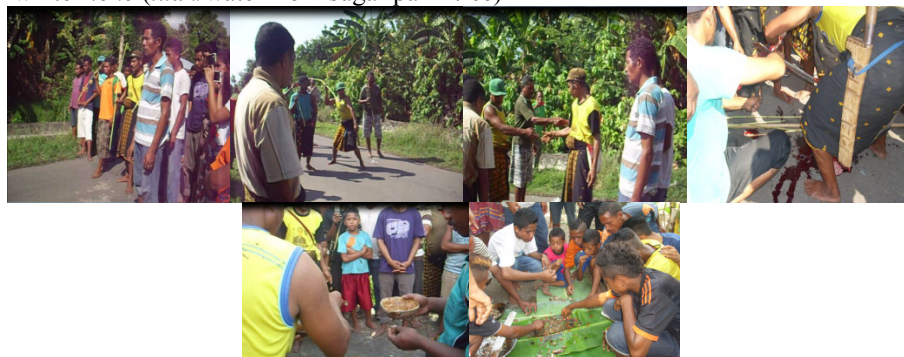
Figure 7. Poko Wako ( wako war/throw), hand shaking/reconciliation, slaughtering piglet, geu he'a tua (exchanging the glass of tuak from coconut shell), eating together without rice in reconciliation rite.