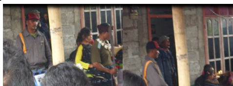
Figure 2. The victim's uncle and sister get out of home as the sign that the keku event will begin immediately.

Keku is the questions in the form of screams. Keku starts from the funeral home, along the road, to the grave and it is conducted during tibo process. Keku is only done by mali or the trusty. For example: Kaju e.....kau da bodu puu zeta tolo nio da pu'u apa, da mode da lima gheso gho or polo dhedo gho (The name of victim is Kaju ... you have fell down the coconut tree, what is the cause, is this due to your less strong hold or due to satan's action).