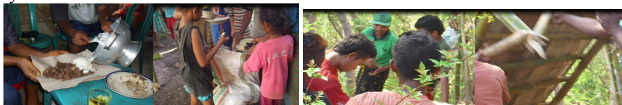
Figure 10. Preparation and the process of disposing entire residual food and tools used in mata golo rite (the disposal location is in the steep ravine with about 100m-depth, in Rodha, Golewa Selatan Sub District, Ngada Regency)

Se De Ze,e is the purification rite. The residual food collected for three successive days and entire residual food material or supporting tools such as heath, wood, kitchen dust, rice, cooked rice, meat, bone, wooden or bamboo couch on which the corpse is put, and etc are disposed to the place specified by mali. The disposal of event residues is called cleaning (purification). Through this disposal, it is believed that, the family has been freed from the victim's bad luck bond or other bad effect related to the victim's death.