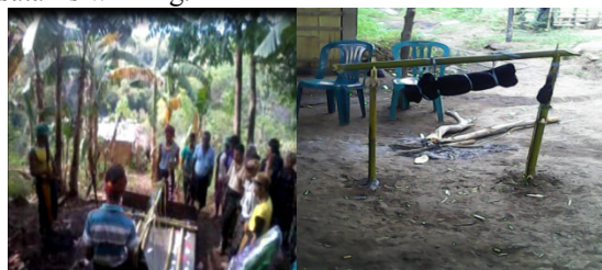
Figure 6. Soka golo event in funeral place Tobo (the corpse symbolized using banana stem wrapped with the victim's clothes).

Soka golo is the rite to confirm the satan's winning that has successfully taken the victim's soul. This rite is performed with a dance called saka golo . This rite aims to return the tobo and to relieve the victim, in addition to legitimize the satan's winning.