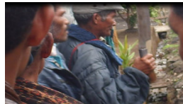
Figure 5. Jai laba polo toward the funeral Source: Research Documentation, December 2015

Jai laba polo is intended that satan has won because he has taken the victim's soul and the family accompanies the satan's winning. Jai laba polo particularly accompanies the victim's body symbolized using banana stem to be returned to the last resting place. This dance is also done when the corpse is delivered to the last resting place.