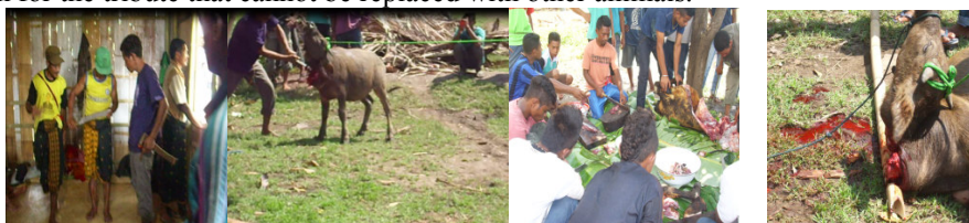
Figure 8. Event procession inside house before buffalo slaughtering, buffalo slaughtering in mata golo event, the activity of cutting the meat to be cooked.

dedicated as the manifestation of expectation for the security in the family left. The buffalo is an absolute condition for the tribute that cannot be replaced with other animals.