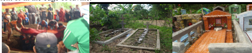
Figure 3. Mata golo funeral process, mata golo grave, mata ade grave.

The mata golo funeral is different from mata ade one. The members of tribe dying in golo manner will be buried in the funeral separated from those dying normally. Mata golo funeral is usually conducted behind the settlement or in the edge of ravine.