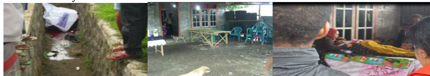
Figure 1. Victim of vehicle accident : the wooden or bamboo couch on which the mati golo corpse is put

implementing the rule is that the corpse is not allowed to be brought into home or sa'o (customary house). For example, when an individual dies because he/she fell down the tree ( roba kaju ): The corpse would be raised from the happening place with the clothes still put on his/her body and having arrived at the house yard, the corpse would be put on the wooden or bamboo couch prepared in the house. This corpse is not allowed to be brought into house because it is mati golo (unreasonable death). In addition, the local community believes it as the rule that should be done to prevent the similar accident from being transmitted to other members of family or the descent of house/customary house.