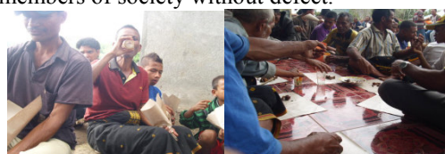
Figure 9. Eating buffalo meat together

Mata golo is considered by local people as the victim's bad luck and will be experienced by family as well. For that reason, the family should recover itself by holding mata golo cultural rite with buffalo sacrifice. The local community will be convinced by the families who invite them to eat together. In this way, the family will be reaccepted as the members of society without defect.