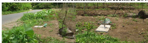
Figure 11: Monument of mata golo symbol