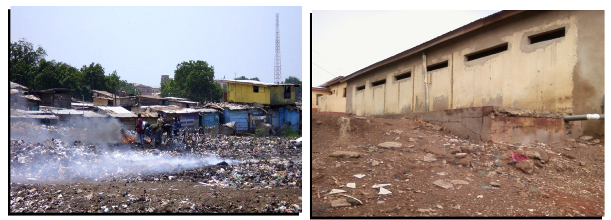
Plate 2: Solid Waste Disposal

The study further revealed that both communities had a public dump site where various households dumped their refuse. In Dakwadwom, it was realised that refuse were gathered in skip containers at the dump site and was collected frequently by the waste management department in the metropolis. Unlike Dakwadwom, the people of Akwatia Line dumped and burnt refuse in an open space. Sometimes it gets the stream choked and causes flood in the community during the rainy season.