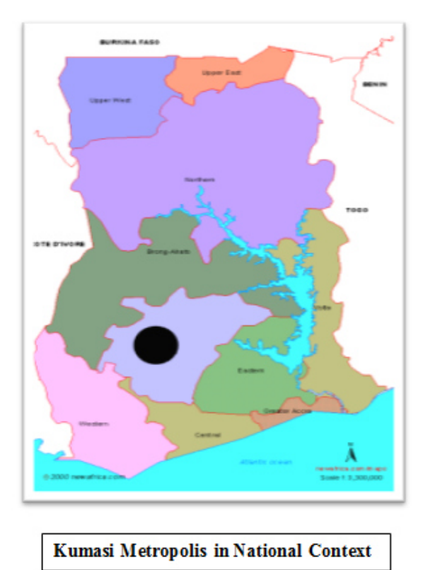
Figure1: Context Map of Kumasi Metropolis

This paper is purely a field study work conducted in the Kumasi Metropolitan Area (KMA) in the Asante Region of Ghana. Specifically, the study covered Dakwadwom and Akwatia line which are all suburbs in the Kumasi metropolis in the Ashanti region in Ghana.