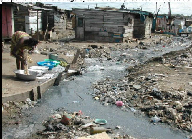
Plate 3: Liquid Waste Disposal in Slums

From the study, it was evidenced that both communities had poor drainage systems as there were no proper drainage channels. As a result, liquid waste was disposed in the open space causing stagnation. The stagnation of the liquid waste serves as breeding places for mosquitoes. Furthermore, it was realised that the dwellers of both communities create trenches in the ground to enhance flow of liquid waste from their homes. Further analysis disclosed that the clustered nature of housing within these communities made it difficult and impossible for proper and safe drainage systems to be provided in the two communities.