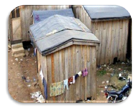
Plate 1: Nature and Condition of Housing Structure

The study further revealed that 88.5 per cent of the houses in Dakwadwom were in bad condition that is the roofing sheets of the houses were corroded coupled with cracked walls and exposed foundations thus, making them death traps for the inhabitants. The remaining 11.5 per cent of the houses were in average condition that is they had at most one of the three problems mentioned earlier. Simultaneously, the study revealed that 94.9 per cent of the buildings in Akwatia Line were in bad condition since the walls of the buildings were wooden and the buildings had latex roofs. The condition of the remaining 5.1 per cent of the houses was average since they were made of concrete but had corroded roofing sheets with some having exposed foundations. The bad condition of the houses in the two communities could be attributed to lack of maintenance as well as fear of losing investments due to evictions. These evidences support the widely held literature that, housing condition slum areas are dilapidated.