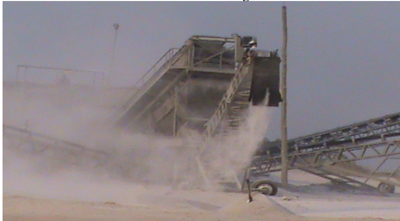
Plate 2: Dust emission from stone crushing