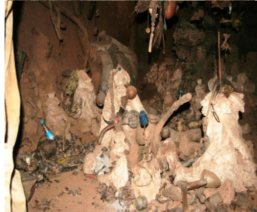
Fig. 11, 12, 13 and 14: Showing ceramic (clay) figurines shrines in Birifoh-Sila Yiri