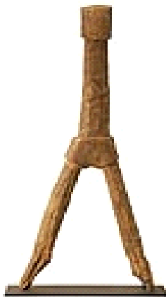
Fig. 2: Showing male wooden sculptures ( Kpiinda )

The ancestral shrine is located at the entrance to the house ( dondore ) leading to the kraal and finally into the courtyard. Among many of the Dagaaba and Lobi, it is made of a wooden, carved human-like stick, somewhat like a ‘Y’ upside down for males, and a straight stick for females (Mbiti, 1989: 9 See Fig. 2, 3, 4& 5). The custodianship of this shrine is in the hands of the family head ( yidaandoa ), which most often is the senior son of the deceased. It is him who addresses and communicates with the ancestor (s), through a diviner, which he usually does before any important decision is made on behalf of the family or lineage (personal communication with the earth priest in Birifoh-Sila Yiri, 2008). Both men and women can have sculptures or ‘ buteba ’ made for them, but with certain conditions. Obviously, being a parent is a primary condition. Also, it is necessary to have died a “proper” death, as well as having lived a “good” life. Usually it is the eldest son who has the duty to make the shrine, and he is considered to “own” it. A woman who was survived by children can also get a ‘ buteba ’ made in her name. Before her final funeral rites, this shrine is kept in her husband’s house, but after the final rites it is carried to the house of her father to be placed beside the shrine of her patrilineal ancestors. It is her senior daughter who makes the ‘ buteba ’ for her.