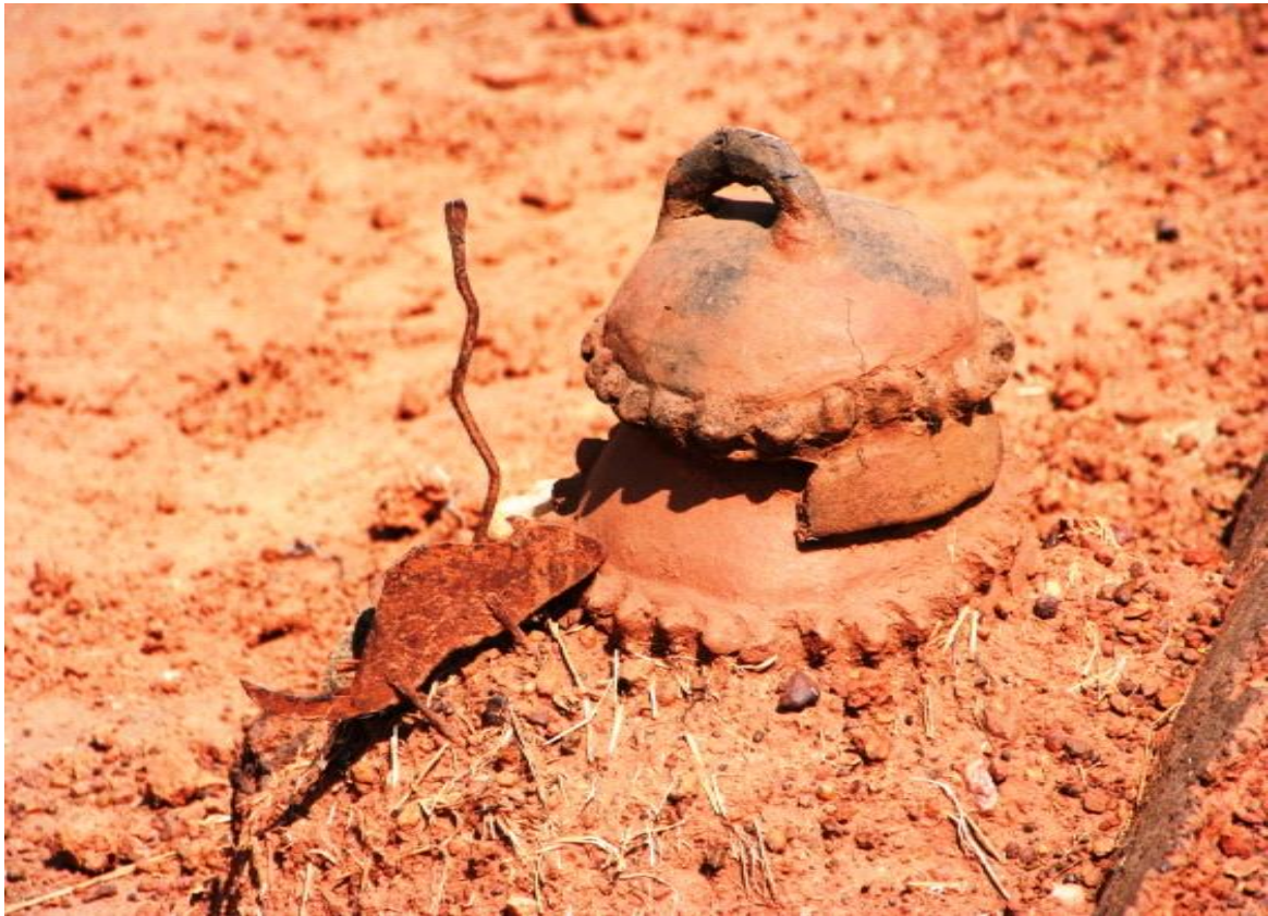
Fig. 8, 9& 10: Showing two Chameleons facing each other and a snake ' GomoNgmin '