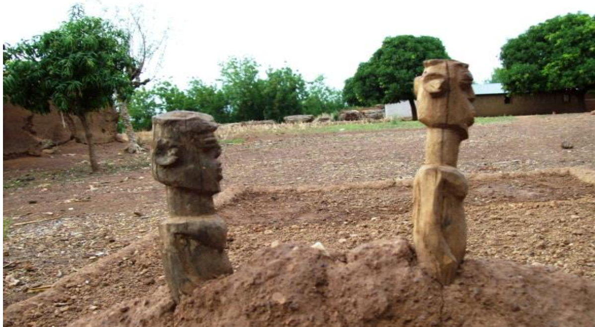
Fig. 5: Showing the grave of a carver with the wooden sculptures planted into the grave

However, every home or compound has an earth shrine located in front of the compound or some corner within the compound (See Fig. 6 and 7). To install such shrines at home, a stone is brought from the grove and that form the basis of the creation of the shrine. Properties found without owners, lost animals and persons are placed in the custody of this shrine. When for a long period their owners are not found animals are then sacrificed to the earth shrine. However, persons are not sacrificed to the shrine but are under custody of the shrine and therefore called ' tenganbiiri ' (i. e. children of the earth shrine see Saako, 2009).