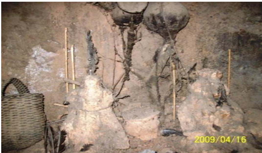
Fig. 19: Showing a personal shrine located within a portion of the room