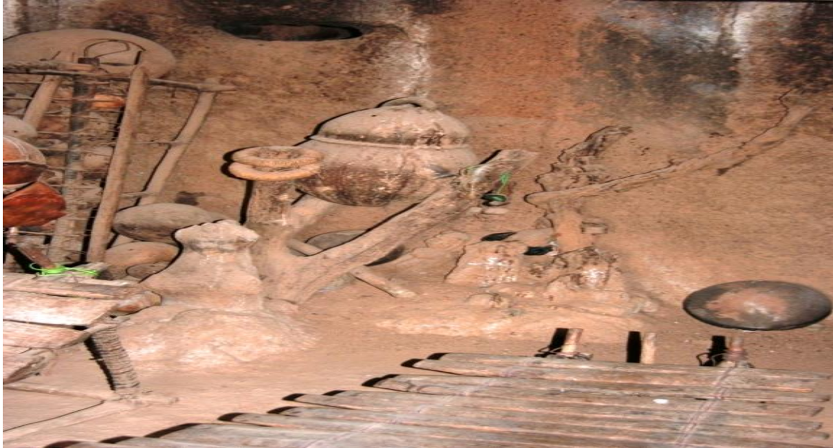
Fig.18: Showing the xylophone shrine

mostly occurs during funerals and festive occasions such as the ‘ Kobina ’ festival (harvesting festival celebrated every year during first week of October). But it is believed that if one consults this shrine it will protect and guide you against such eventualities (See Fig. 18).