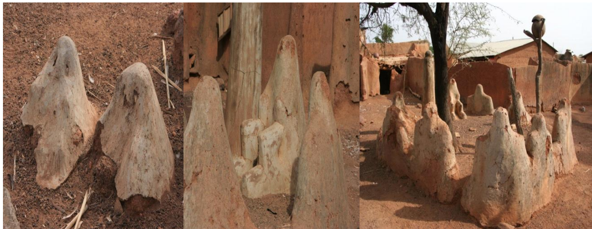
Fig 21, 22 and 23: Showing ceramic/clay figures ( kunkpenibie ) in BirifohNaa Yiri

This shrine is purposely for protection against any evil deeds and curative purposes of people who have been inflicted with some evil spirits. There are periods within the year that these clayed built figurines are rehabilitated. This shrine is unique because of the size and the arrangement of the figures and particularly its location within the Naa Yiri (i.e. royal of the Birifoh traditional area). However, kunkpenibie is a shrine that everybody can consult both near and far for their protection and prosperity (See Fig. 21, 22&23).