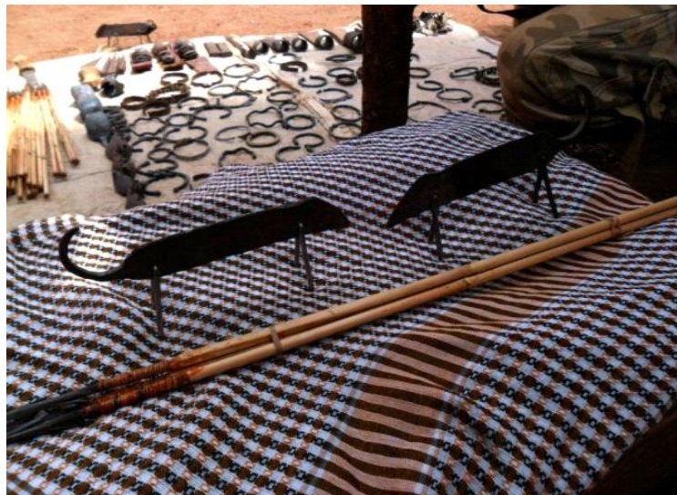
Chameleons and other metal objects in the market