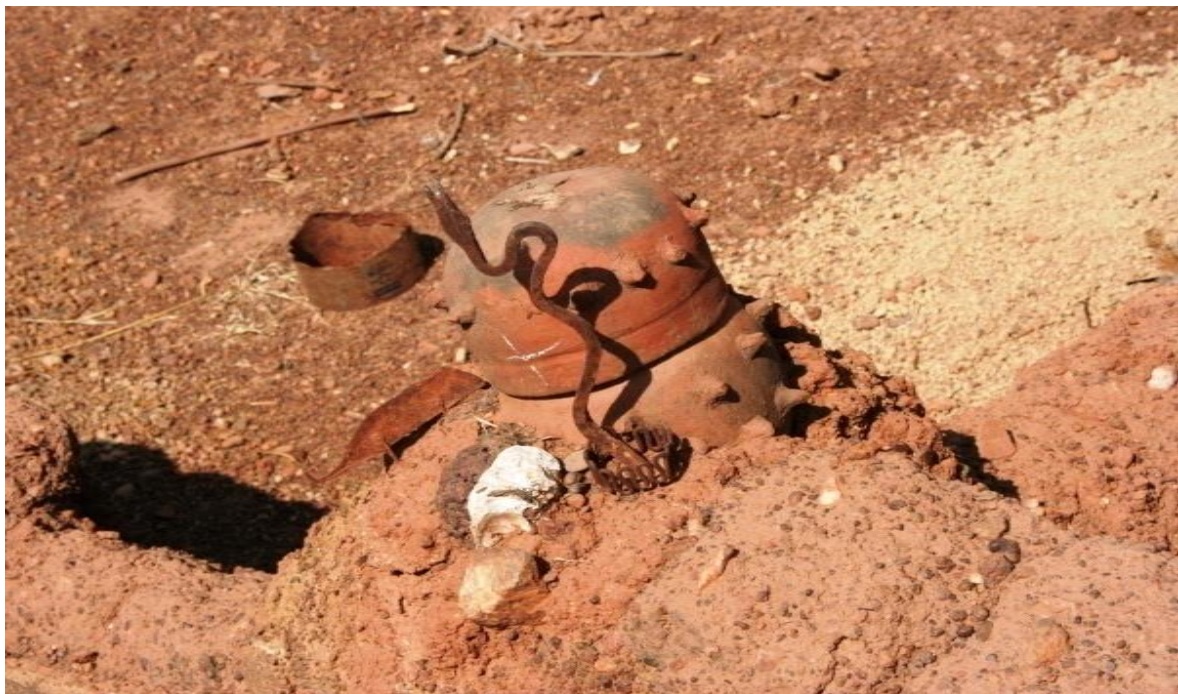
Fig. 8, 9& 10: Showing two Chameleons facing each other and a snake ' GomoNgmin '