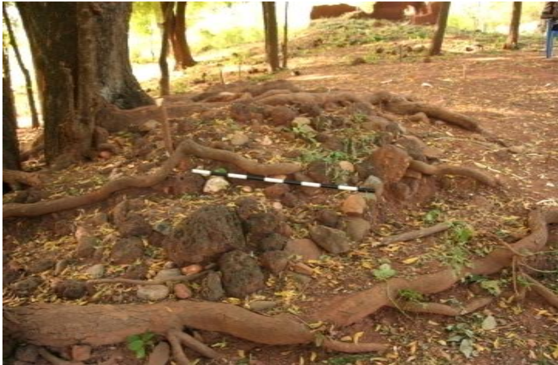
Fig. 6: Showing the earth shrine in Birifoh-Sila Yiri