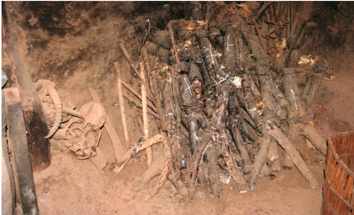
Fig4: Showing a pile of wooden figurines in a room within the courtyard in Birifoh-NaaYiri

There are some specific trees that are used in carving these figures. These include Fig tree (Koltaan), long thorn 'Guo' ( Acacia Albida ), bamboo, and ebony tree 'Gaa' ( Diospyros mespiliformis ). However, the ebony tree is the commonest used in carving these sculptures in Birifoh. This is because it can resist termites' infection. But sometimes a bamboo stick is used to represent a female ancestor according to C. D. Ninkara (an opinion leader in Birifoh-Sila Yiri). The 'buteba' is the material representation of the deceased, and during its creation, the shrine (the stick) is treated in the same way as the corps at the funeral (Goody, 1962:228; Mbiti, 1989:10). Sacrifices to the ancestors are usually first made after some misfortune has occurred, such as serious illness, crop failure, or death. A diviner is consulted to reveal the cause of the misfortune and he prescribes the appropriate sacrifice.