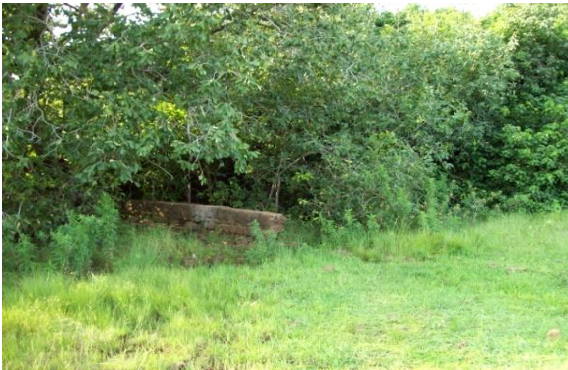
Fig.7: Showing the earth shrine in Birifoh ( Birifoh-Bãã )