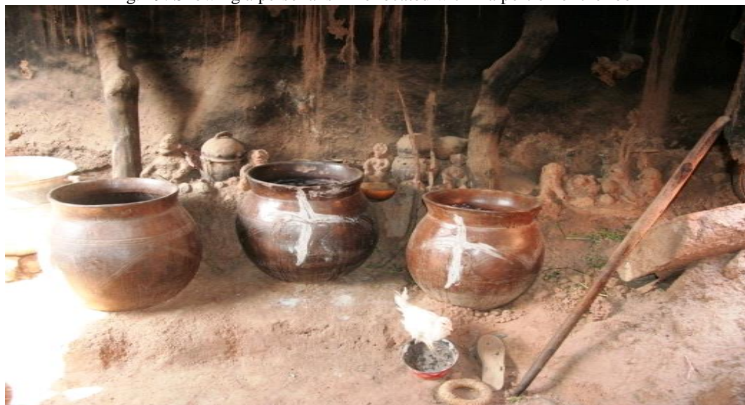
Fig.20: Showing a personal shrine located within a portion of the room of a pito brewer