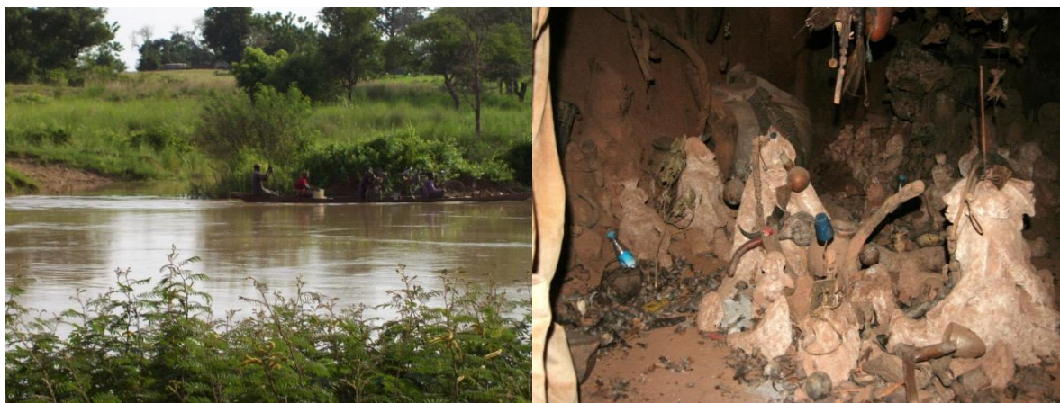
Fig. 15 and 16: Showing Bosigri River (i.e. Black Volta) and dwarfs/kontome shrine

The river shrine is installed after an incident has occurred and a diviner consulted. The person would then be told to establish such a shrine because it wants to be associated with him/her. Before installing it, the person must go to the river side with a fowl and make a sacrifice there. After the sacrifice, the person picks a stone and collects water and mud from the river to constitute items that will be used to install the shrine which is in the form of 'kontome' (i.e. images moulded with clay to represent them : See Fig. 15 & 16). This shrine is for either hunting ( tem meoni ) or general family welfare including childbearing ( dogrung ) and material prosperity ( yelsungne ).