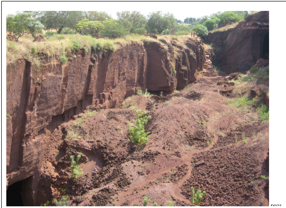
Plate 1: Environmental degradation and loss of livelihoods strategies caused by world economic crisis on the impacts of the need for housing construction