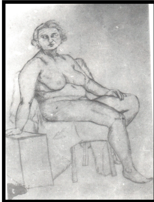
Fig. 4: Life Drawing of European Women, 1957