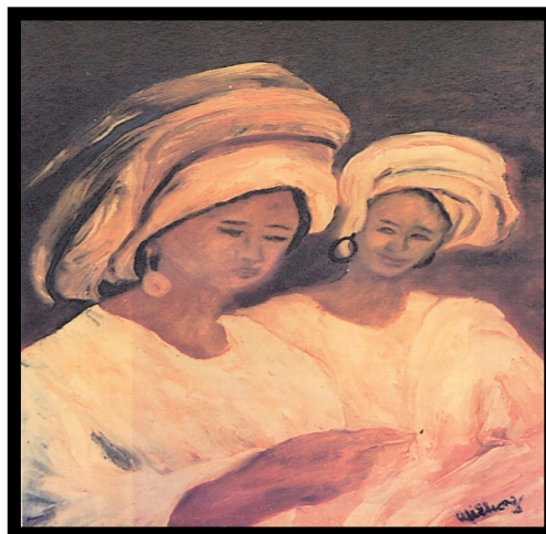
Fig. 3: Two Yoruba Ladies (Sisi Eko), 1993 51cm X 41cm

The period she came back from Britain was bustling with the spirit of nationalism 1957 – 1960. It was not particularly a period of great art appreciation. The country was involved in the struggle for self-rule and was under political pressure. Patronage was largely from expatriates and the standard of living for Nigerians was too low for art patronage. Nevertheless, she was quite productive and exhibited regularly. Her very interesting series comprised women gorgeously dressed with elaborate headgears popularly known as Sisi Eko. ( Fig 3 ). Her paintings raised issues about rural and urban women. Through such paintings she advocated the centrality of women, liberation and empowerment, in the new independent Nigerian nation. This was then an idea ahead of its time, and only currently having a wider embrace by the Nigerian society.