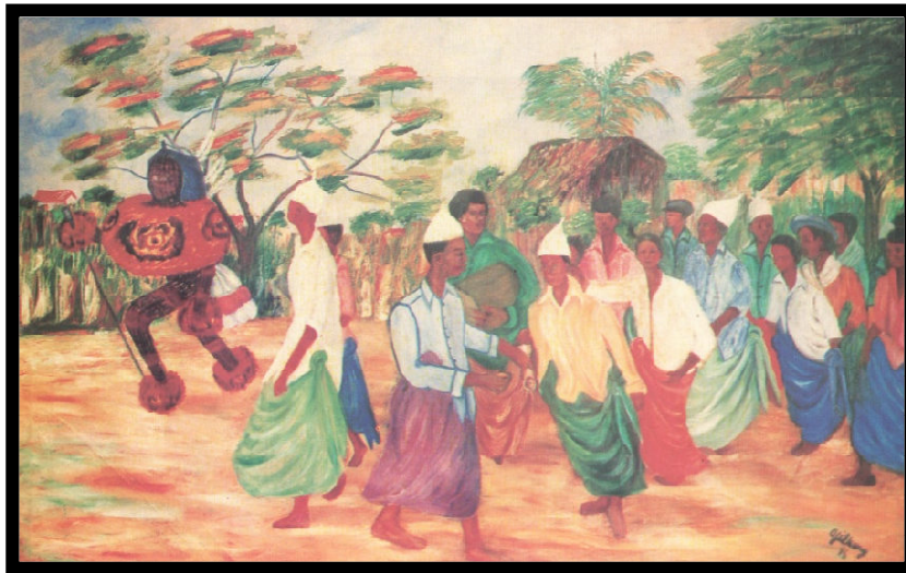
Fig. 2: Ekpe Dancers, 1996 164cm X 107cm

time traditions and cultural life of Nigerians as a social fabric, which bound the people together before the advent of colonialism and subsequent westernization.