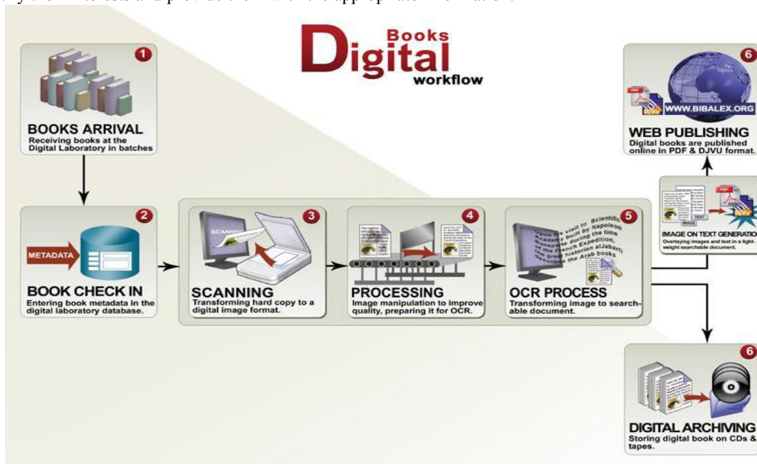
Fig. 1: Show the DIGITAL BOOK WORKFLOW.

Department of systems and information networks : boils down to his role in the establishment of information networks of the center and linked to networks of local, regional and international. The acquisition and construction of local rules and global and electronic libraries on different types and retrieval of the beneficiaries ( CD-ROMs , Internet , etc. ) and the work of her statistics. Inventory and classification of beneficiaries and to identify their interests and provide them with the appropriate information.