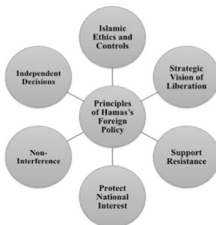
Figure 2. The Main Principles of Hamas Foreign Policy