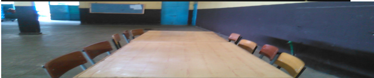
Feeding room for students with disabilities