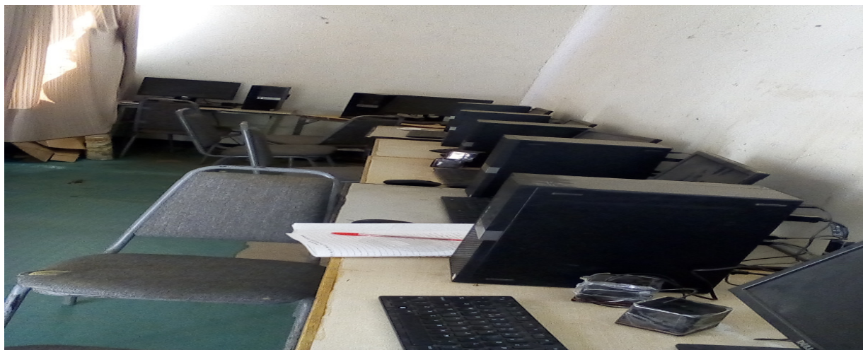
Internet room for students with special need at Wollo University

Regarding the availability of note takers, lab and library assistants, readers, and sign language interpreters, respondent teachers explained that universities did not have specially employed auxiliary aid provider for students with disabilities. Due to having this problem as case 1 described, the university referred deaf students to Addis Ababa University which has a sign language interpreter. Universities did not give due attention to have these professionals who gave support services for students with disabilities due to having low number of students with severe disabilities. To solve the problem of students with blindness and wheelchair users temporally, university administrators assigned their 'normal' peers in order to provide reading, guiding, and pushing wheel chairs services with low fees (Wollo and Gondar Universities). However, students during the interview and FGD reported that these support services are not sufficient.