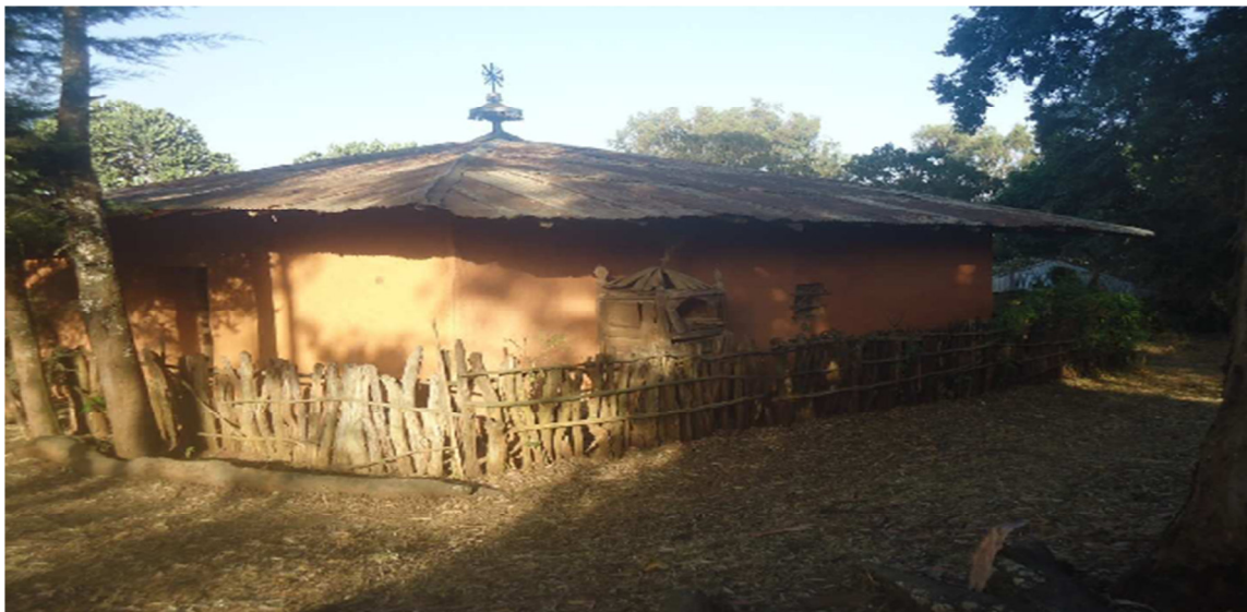
Picture 3. St. Sillase Orthodox Church constructed by Fitawrari Duguma in 1930 E.C.