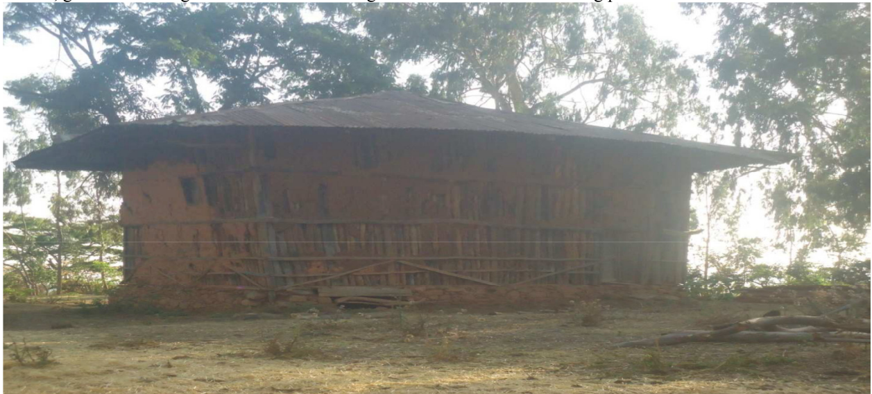
Figure 1. Fitawräri Duguma Jaldeso's Palace, constructed in 1930 E.C/1938. Photo taken by the author, February, 9, 2013.

In short, the poem reveals his heroism and determination in facing his enemies. In 1938 Fitawräri Duguma constructed: his palace, fortification, church and his future grave around his administration site. His palace is registered as the third important palace in Wollega zone next to Dajjach Kumsa's palace of Leka Nekemte and Ras Mokonnen Damiso's of Arjo awräjä during this study conducted. Nowadays Duguma's palace, fortification, church, grave are still significant historical heritage of Limmu. See the following picture.