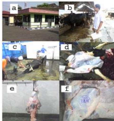
Figure 1. The Procedure of Livestock Slaughter in Malang Slaughtering House

Slaughter process is conducted to get meat which is safe-consumed, healthy, intact, and kosher. To produce high qualified meat and fulfill such characteristics above, the slaughter process is conducted in Islamic procedure supervised by a vet or Keurmaster Officer (Fig. 1).