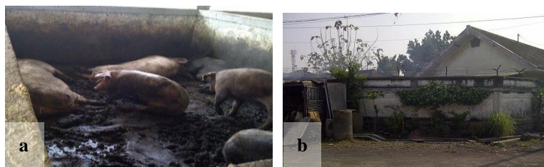
Figure 6. Pig stall. a) inside; b) backside