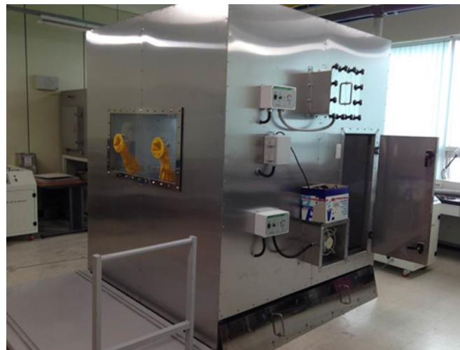
Fig 3. Multi-purpose radon chamber