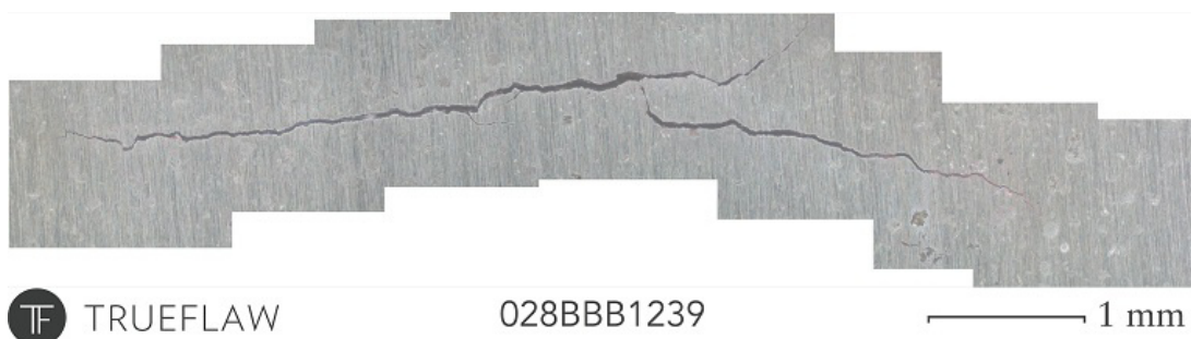
Figure 2. Microscopic photograph of the surface opening of one of the thermal fatigues offered to the project. Pictures with a higher resolution are available at the webpage