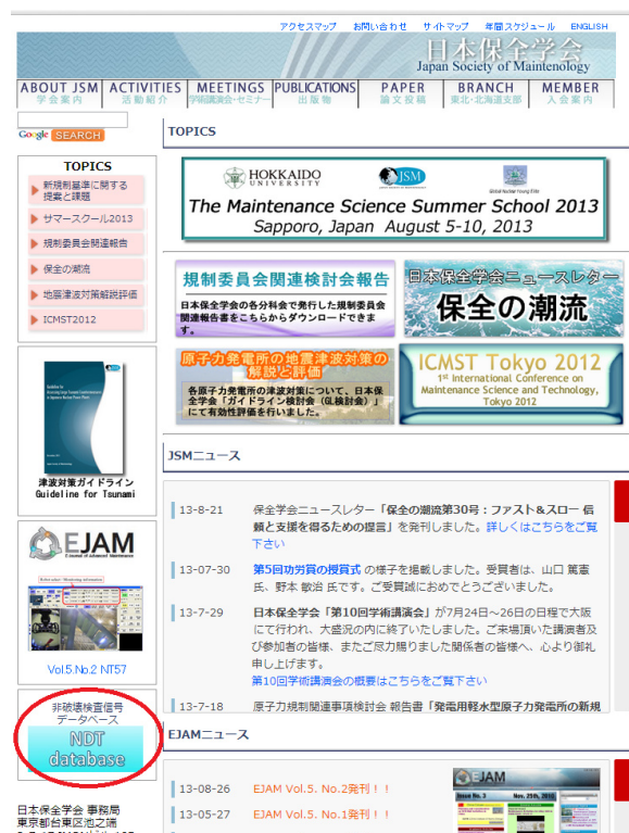
(a) Link to the project situated at the top page of Japan Society of Maintenance website

The authors would like to acknowledge all the participants of the round-robin test. The authors thank the Japan Society of Maintenance for supporting this project.