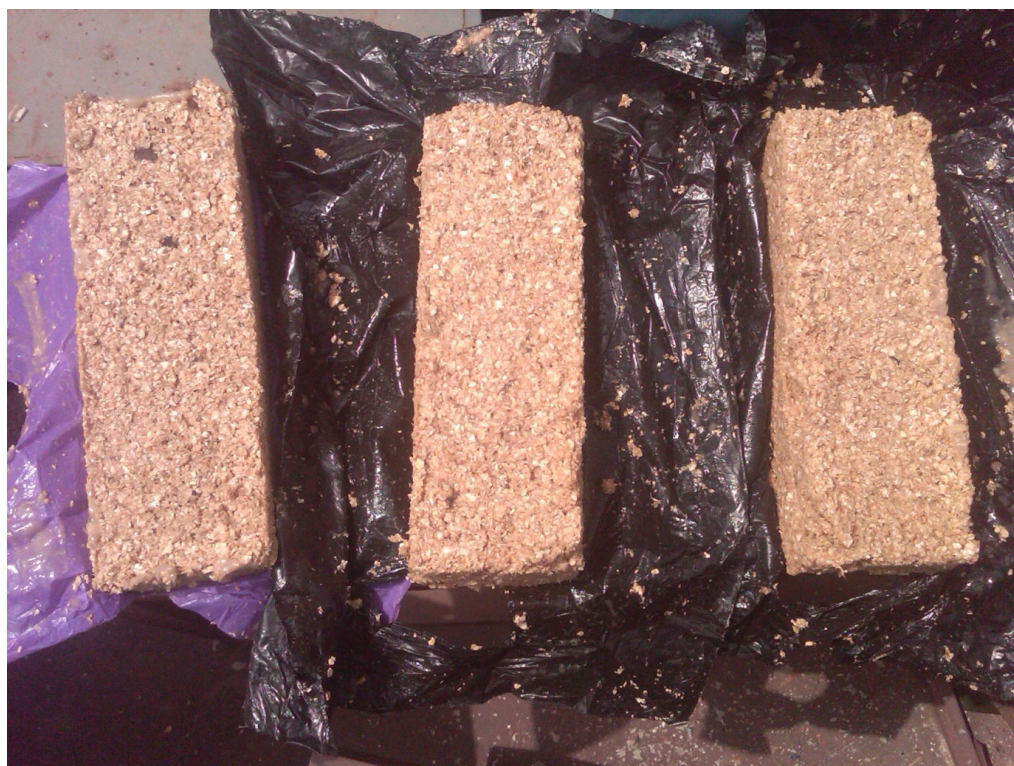
Plate 3. Briquettes produced from Yam peels