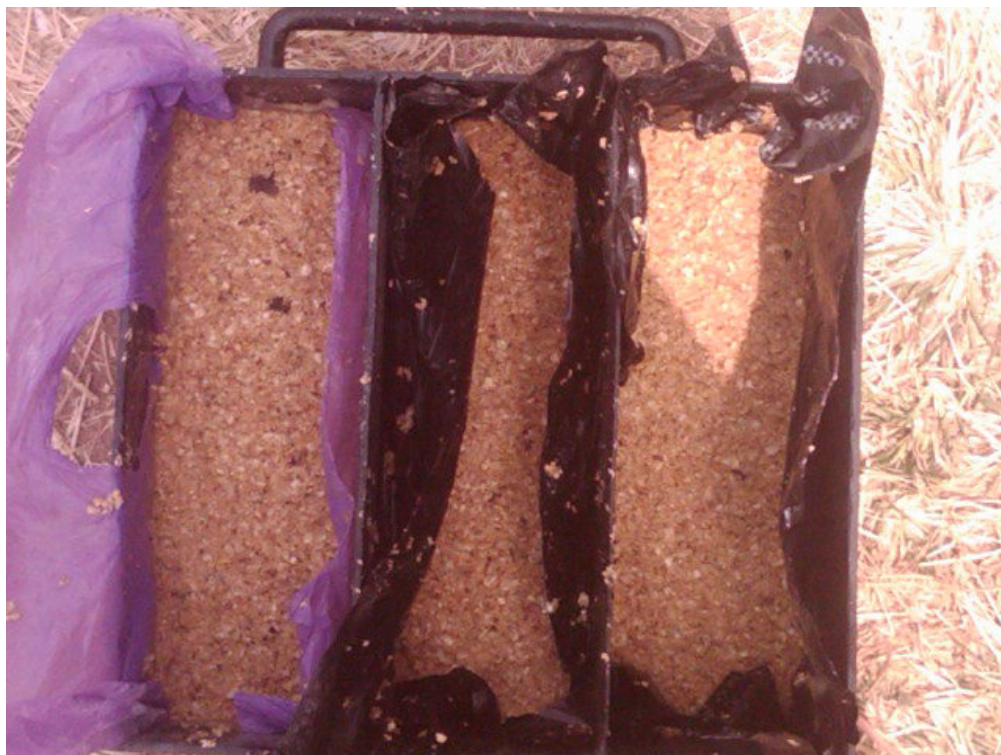
Plate 2. Briquettes produced from Cassava peels