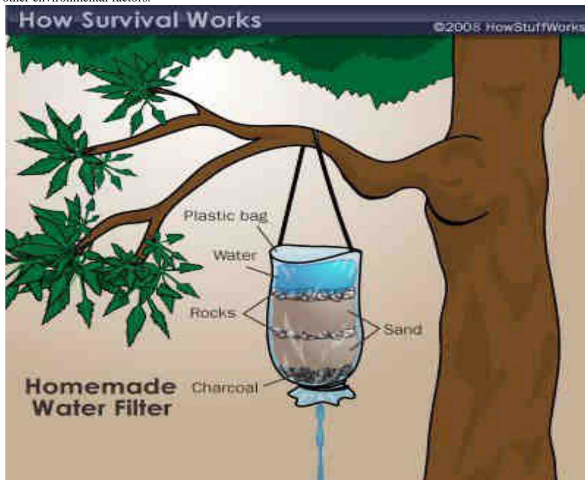
Figure 1. Home made Water Filter

Wastewater is water that has been used for washing, flushing, or in manufacturing processes also is generated by residential, institutional, commercial and industrial establishments. It includes household waste liquid from toilets, baths, showers, kitchens, sinks and so forth that is disposed of via sewers. Water quality is influenced by natural factors and by human activities, both of which are the subject of much hydrologic study. The natural quality of water varies from place to place with climate and geology, with stream discharge, and with the season of the year. After precipitation reaches the ground, water percolates through organic material such as roots and leaf litter, dissolves minerals from soil and rock through which it flows, and reacts with living things from microscopic organisms to humans. Water quality also is modified by temperature, soil bacteria, evaporation, and other environmental factors.